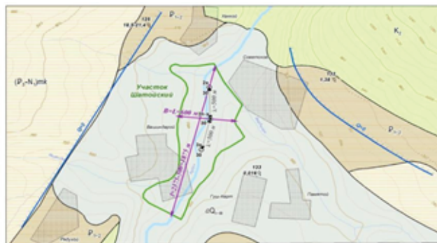
Figure 2: Scheme of the Reserves Calculation of the Shatoyskiy Area.

It follows from the above stated calculation that with the row 1000 m long and with the productivity of 333,3 m 3 /day of the exploitation wells, the average distance between the wells is 500 m, the water intake capacity will be 1000 m 3 /day and the reserves will be provided.