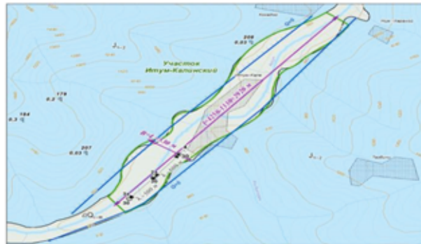
Figure 3: Scheme of the Reserves Calculation of the Itum-Kalinskiy Area.

The accepted flow rate of the water intake well will be 333.3 m 3 /day. The possibility of obtaining the projected flow rate is proved by the experimental works during the search and evaluation works.