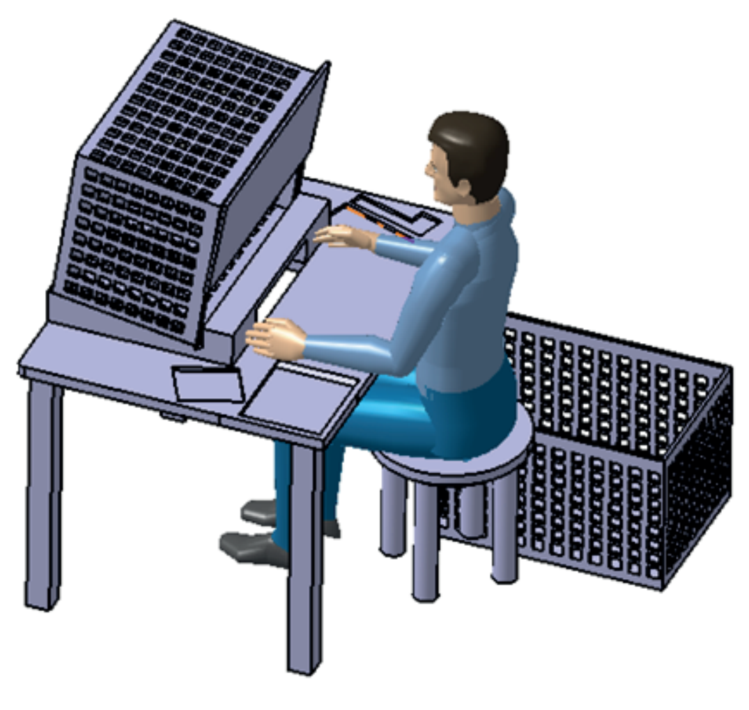
Figure 3: Design 1.