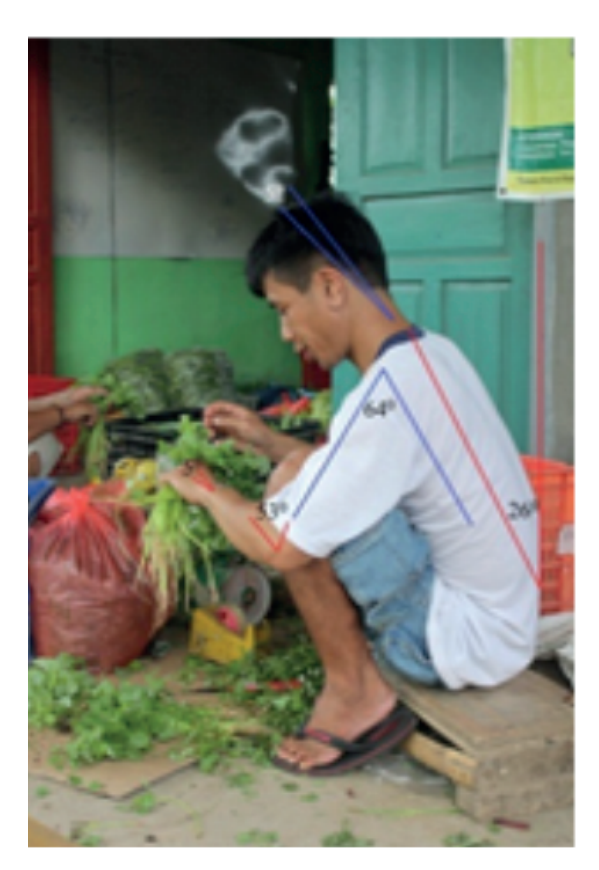
Figure 1: Working Posture at Handling and Weighing Materials Element of Work.

It is known that elements of work of handling and weighing the materials on the packaging work station have the worst OWAS scores. Therefore, the determination of packaging work station as the worst will be the focus of the improvement of working facilities.