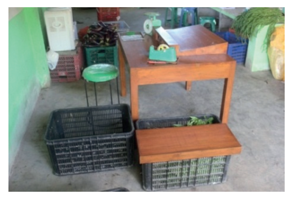
Figure 5: The New Working Facility.