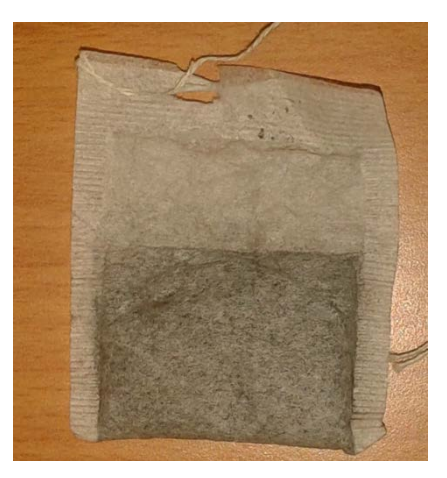
Figure 1 Primary packaging of beverage made from snake fruit seed

SMEs application opportunities of cleaner production principle, based on field investigation, include: the utilization of treated wastewater and snake fruit skin waste, layout improvement, and efficient use of energy.