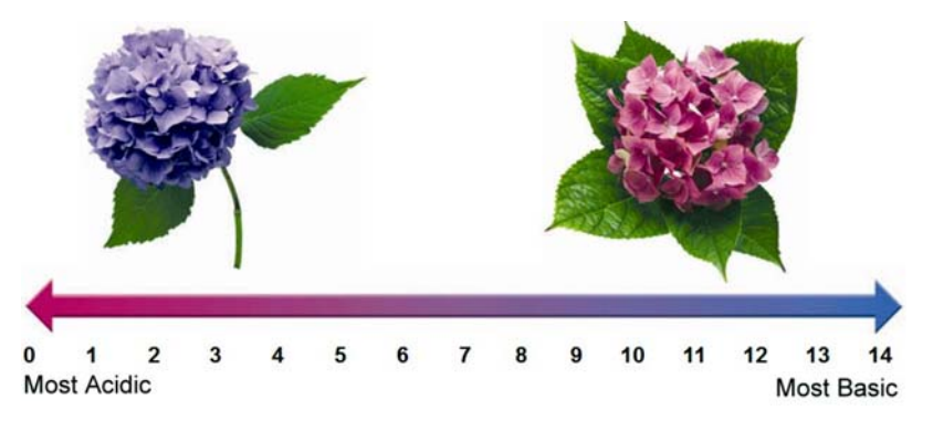
Figure 2: Colour change on Hortensia's sepal due to different soil pH (Heisdorffer, 2012).

Halcomb & Sandra (2010) reports that the acidic soil pH range (4.5 to 5.5), expressed blue colour. In the range 6-7, the colour is pink, whereas in the range 5.5 to 6.5, it can be pink, light blue, light purple, or a mixture of these colours on the same sepals (see Figure 2). Wade (2009) reports that the mechanism of colour variations on Hortensia can be affected by the presence of aluminum and iron. Aluminum and iron that accumulates in the cells of Hydrangea's sepal can form a more stable colour complex.