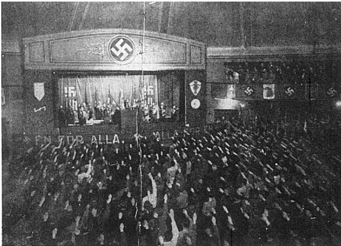
Figure 4. 'One for all – All for one'. The party salutes Lindholm. DSN, no 35, 1938.

from branches across the country, but on the second day the Party Leader would speak to the rank-and-file (usually around 2000 members). In 1934 'Lindholm had tried to avoid personal acclamation from the members, but it was the only thing at the convention that failed – completely spontaneously the bubbling shouts of hail came to him, from the depths of a thousand hearts.' 448 By 1935 a ritual was developed for the congress. Once all members were gathered, the band played a song such as Friheten Leve , and the Leader ascended the podium to ovations and shouts of hell Lindholm . 'An outsider cannot understand the heartfelt contact that exists in a moment such as this between Leader and followers, but we know that this natural, voluntary solidarity, founded on the kinship of souls, only exists among us', DSN insisted. 449 After a lengthy speech assessing the continued party struggle, Lindholm made an appeal for onward struggle. With the close of the speech, Lindholm shouted out to his followers: 'One for all!', to which the audience responded with a resounding: 'All for one!' [ En för alla – Alla för en , figure 4]. 450