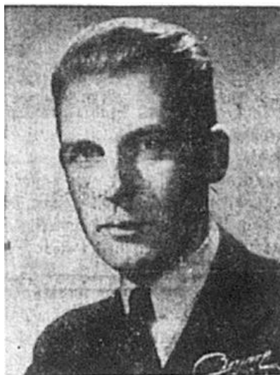
Figure 6. Front page picture of Lindholm, DSN , no 35, 1938.

Lindholm's myth was far more stable. Rather than a prophet predicting imminent and total victory, the ascetic frontline soldier-chieftain promised a long and hard struggle demanding the utmost discipline as per his own example. Consequently, the opening for scepticism and outright rebellion did not immediately come from the lack of electoral success – never as dramatic as the NSB's loss of half its vote in 1937 – but from his and the Party Leadership's decision to alter and even reverse the mythopoeia the party apparatus had worked on for years. After years of constructing Lindholm as the moral and uncompromising revolutionary Leader of Swedish fascism, the New Direction [ nyorientering ] created a new, respectable Lindholm, a suited nationalist politician open for compromise with other parties.