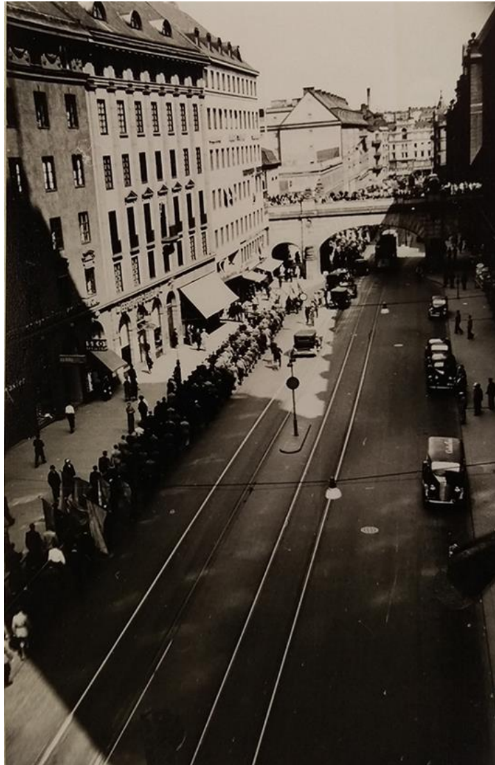
Figure 5. The NSAP marches along Kungsgatan at the 1938 convention, while onlookers watch from the bridge.

The long, central street was much busier than Karlavägen, with its tram lines and two-way traffic, which detracted a great deal from the overall impression. It did have the advantage of a large picturesque bridge over the middle of the street, from which crowds could view the entire train as it extended across the street. Unfortunately for the party, the marching columns were significantly marred this day by what was afterwards described as sabotage by the police. Apparently this had also undermined the march somewhat on Sunday, but was even worse now. Police constables walked along with the marching columns, which were obliged to maintain the same pace as the constables. However, as the police men walked at different paces, the columns ended up further and further apart, of a distance up to 200 m, something which seriously undercut the impression of a single unified army. According to the police this was so that traffic could continue to flow –