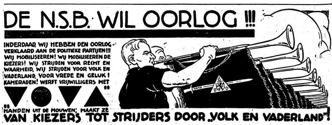
Figure 4. 'The NSB wants war!!!', VoVa , no 23, 1935.

yourself a sword', declaimed one DSN poem – 'Your Sweden calls you: / Your place is in the freedom army, / join, become a fighter, a man'. 670 The NSAP was particularly sensitive to the 'spirit of struggle' [ kampanja ] and comradeship that permeated large uniformed meetings. As Porg explained, '[w]ith the uniform a renewed kampanja always follows, which elevates the impression of the meeting and has a good effect on new comrades.' 671 There was nothing quite like a uniformed gathering of party comrades to strengthen the bonds of 'comradeship and the will to victory'. 672 This myth was discursively relentlessly reified through military metaphors, which in publications as well as internal documents imagined the parties as armies which 'conquered' and 'attacked', waged 'a struggle for freedom', 'bloody battles', and 'war'. 673 'Our struggle is revolutionary and fought honourably. You are needed at the front.' 674 Visual depictions of the party often relied on military references, constructing the party as a fantastical military army [figure 1].