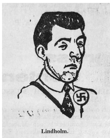
Figure 5. 'Gangsterledarna slåss om subsidierna', N! S! K! , 17 January 1939.

healthy and handsome sergeant, caricaturing him as strange and ungainly, an unkempt 'nazi wastrel' and gangster boss cravenly vying for German approval [figure 5].