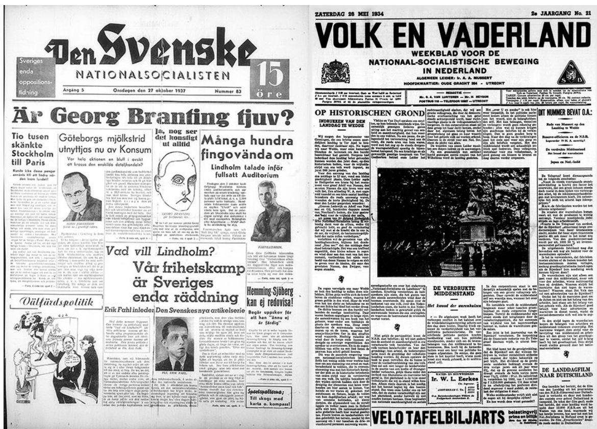
Figure 3. Front pages of DSN and VoVa respectively. The front page of DSN changed in 1937, when the fraktur header was introduced, and more photographs could be printed as the party acquired its own press.

The VoVa and DSN distributors, colporteurs, were the most visible and regular manifestation of the party to the public. Every day, party members took up posts in public spaces or patrolled neighbourhoods, advertising the paper to passers-by. Colporteurs were the most obvious fascists the public encountered on the streets, and thus functioned as immediate participants in the parties' mythopoeic efforts. They were, in Mussert's words, 'the lancers of the Movement', itself a phrase redolent of myth, of heroic soldiers of war in a tradition going back to early modern times. 234 The fantastic description seemed appropriate, as they were indeed not only the members the public would most commonly encounter, but also those most likely to be involved in violent incidents, especially in the Netherlands. Newspapers regularly carried reports of fights breaking out between colporteurs and Communists, fights which could occasionally escalate into veritable riots. 235 Particularly after the ban on political uniforms, it was precisely the selling of the party newspaper which identified one as a fascist.