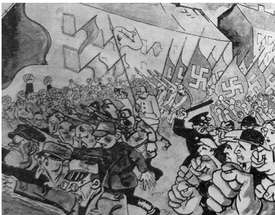
Figure 3. Storebackegatan at Masthugget, as our artist saw it on Sunday evening.' Arbetar-Tidningen , 1934, newspaper clipping, National Archives of Sweden, Arminge.

The NSB's Disciplinary Council, partially set up to resolve internal disputes, functioned chiefly to protect the party's image and settle cases for the benefit of the party in case of disciplinary infractions. 770 While many of the surviving carbon copies of the case files deal with various forms of internal insubordination, there are also numerous instances of members flouting behavioural prescriptions, while wearing insignia. One Rotterdam member, a notorious alcoholic, got drunk in a café while wearing the triangular party insignia on his coat. Trying to start a fight in the café, one of the first priorities of his comrades was to remove the insignia from his clothes, commenting that 'that was no propaganda for the NSB'. 771 Such cases of fascist drunkenness are some of the most common in the council files. 772 Naturally this contributed to the image of fascists as undisciplined and immoral boors, and did not just undermine mythopoeic efforts, but straight up reinforced negative stereotypes. One member was found to be carrying a German Parabellum pistol during the work camp mutiny at the 1935 Hague convention work camp mutiny, while