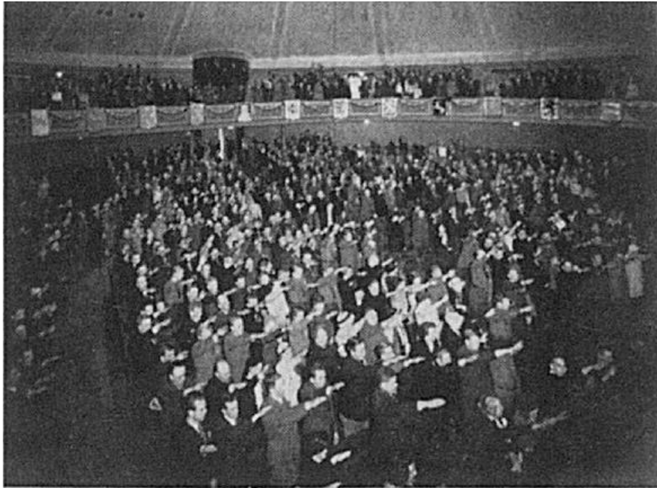
Figure 3. The NSAP salutes the massed standards at the opening of Sveatinget. . DSN , 1935: 46.

Then Lindholm spoke to welcome the attendees to the ting , followed by another popular party song, Folk i gevär (A people in arms), thematically identical to Friheten leve! , but with a more anti-Semitic emphasis, sandwiching the event opening between militaristic music dramatising the party struggle, while the movement found itself gathered with its leaders in the capital for the first time, at a politically heady time of growth and opportunity. 866 The whole ceremony took a little over half an hour, an aesthetically intense moment which readied the audience for the drier parts of the årsting that followed. In Lindholm's diary it is this first half hour which he emphasises, the 'heartfelt ovations, song and marching music'. 867