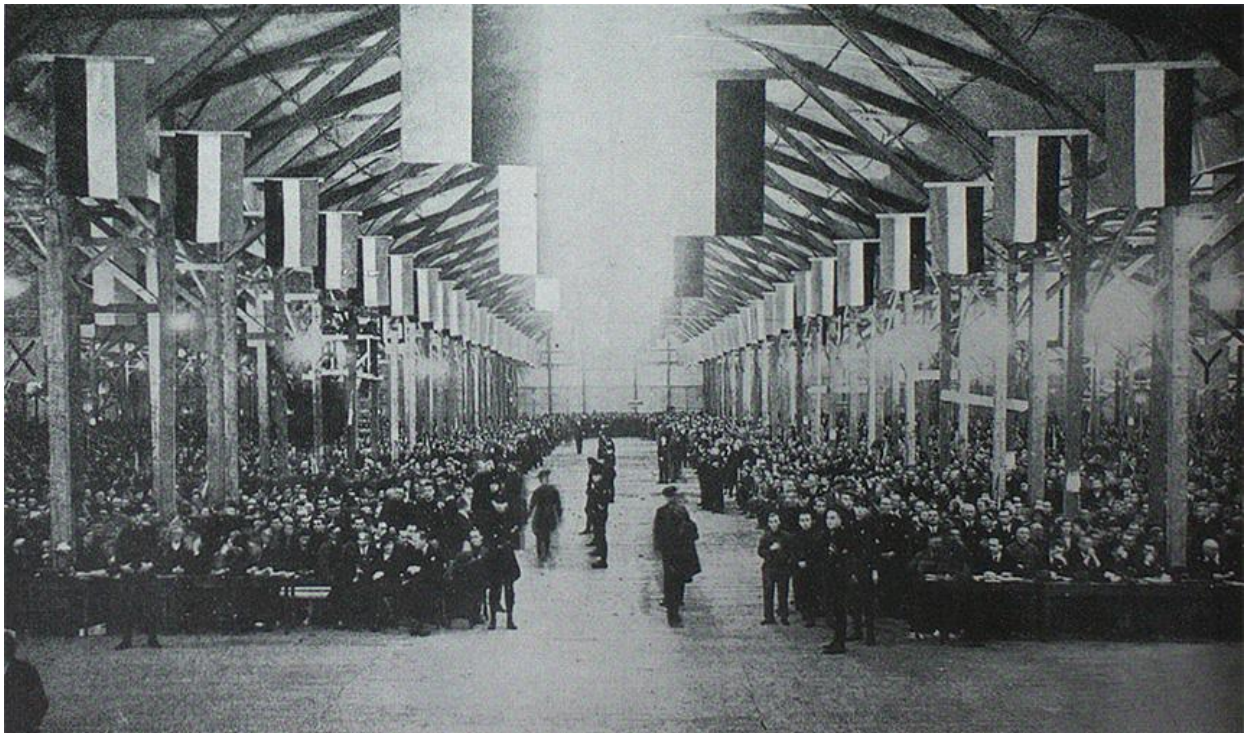
Figure 8. The tent on the inside as the landdag is about to begin. Note the wide central aisle. Het Landdag Gedenkboek , 1935.

As the procession entered the Leyweg just before seven it had become dark, so that the marchers could from a distance see glowing letters at the entrance of the convention terrain, spelling out HOU ZEE , ‘as a symbol of our radiant self-confidence, our hope for the future of the entire Dutch people’. 963 At the entrance the two columns split, and then divided into sixteen groups to be seated in designated places in the tent. 964 All NSB reports proudly mention how smoothly this occurred, and the detailed organisation that was required. It would seem that the NSB realised that organisation itself had mythopoetic potential. The tent was impressive. It created a majestic space, well-lit and festooned with endless rows of vertically suspended orange-white-blue flags. The stage was painted in black and orange, with an enormous golden rampant lion as backdrop for the rostrum. A special podium had been constructed for the music band, orchestra, and women’s choir.