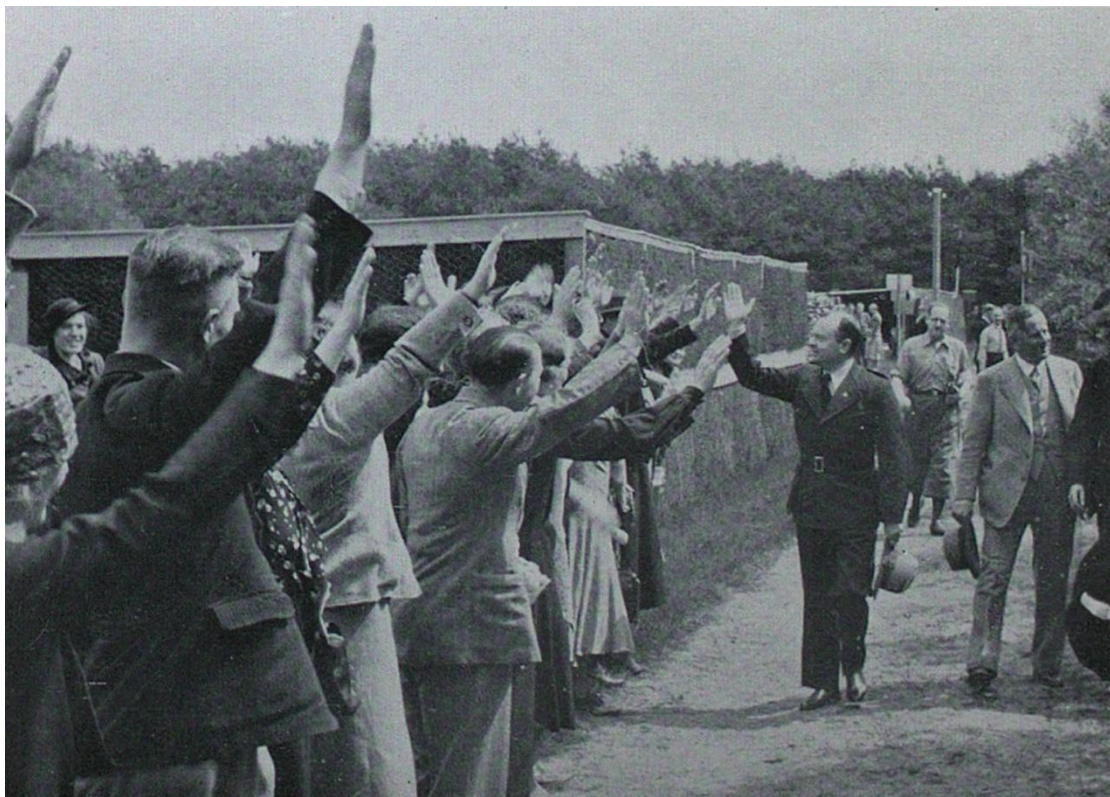
Figure 3. Mussert enters the Goudsberg. From De Hagespraak (1936), p. 20.

propagandistic value', according to the propaganda department. 439 When Mussert returned from his successful trip to the East Indies by airplane, a commemorative plate was gifted to him, of which subsequently 600 copies were made available to the more devoted members. 440 Moreover, every party convention was used as an opportunity to sell high quality, illustrated commemorative books, which prominently displayed numerous pictures of the Leader, as advertised in circulars and VoVa, for prices as low as f 0.75. 441 The illustrated Gedenkboek (Commemorative Book) of the 1936 Hagespraak rally, produced by the graphic art institute Hobera in black and red, featured not only Mussert's speech in full, but over a dozen pictures of the Leader, delivering his speech, talking to functionaries, and of course greeting his adoring followers [figure 3]. 442