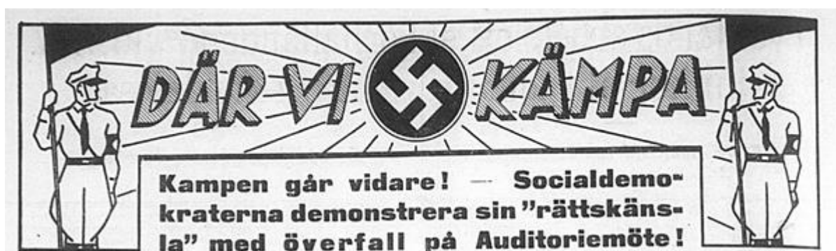
Figure 5. 'Where we fight', DSN no 26, 1933.

The NSAP's depictions of the party member were perfectly uniformed, over-emphasising the masculinity of the fascist, but did not appear to have access to any artists of the same (still not very impressive) calibre as the NSB, instead using somewhat more abstract depictions most of the time. The result was eerie, but highly appropriate: an idealised figure unrecognisable as an individual – the perfect fascist, nothing but a uniform. These smaller images were recycled over and over again as column headings and the like, repeatedly imprinting on the young membership the importance of the uniform [see figure 2].