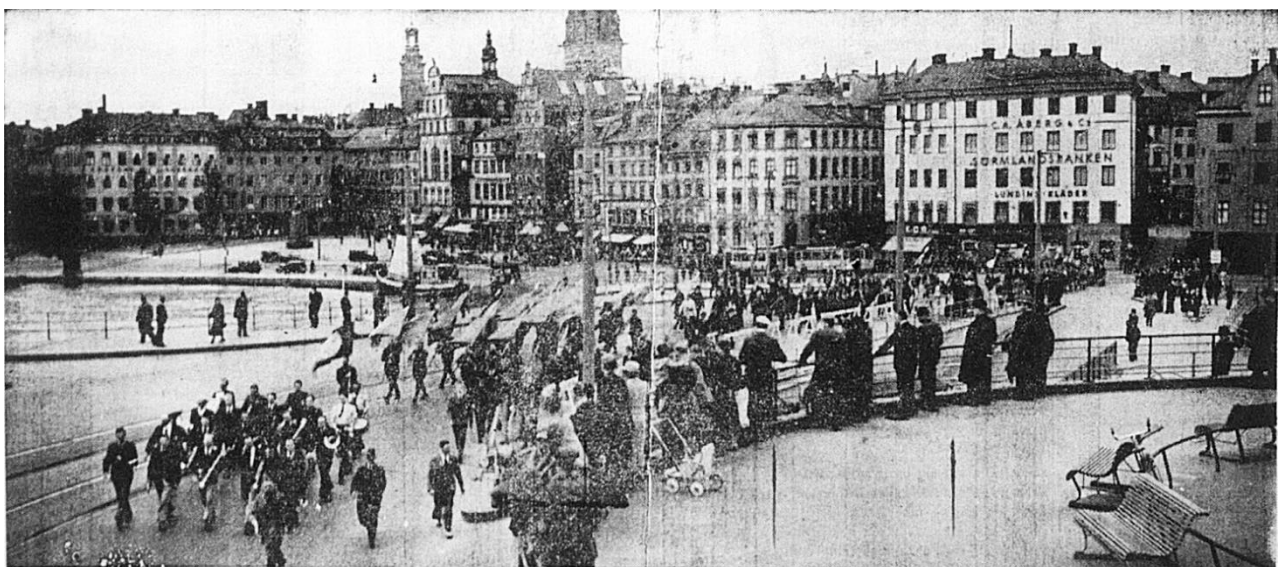
Figure 4. The NSAP marches from Stora Nygatan onto Slussen at the 1937 convention. DSN , 1937: 38.

also significantly lengthen the marching army, with a strong effect on the longer streets. Sveatinget marched south, with a route that took the army straight through Stadsholmen, the geographical and historic heart of Stockholm. Here the ranks of three filled the space neatly, while at the same time allowing the snaking march to uncurl to its full length all along the street. From the steeply elevated side streets and alleys east of Stora Nygatan onlookers would have been able to look down on the marching fascists. Doubtless this, and the exit from Stadsholmen onto Slussen (the sluice), was the thought-out climax of the march. Slussen provided an excellent vantage point from which to watch the procession snake along the street towards the southern district, probably the only point during the march from which one could see the army in its entirety. Evidently this part of the route was deemed good enough to repeat in its entirety at the 1937 årsting , when the party had clearly developed a better mise-en-scène to capture a shot of the mythic spectacle that the marching army created. (Evidently photographing their own spectacles was something the party took time to develop over several years.)