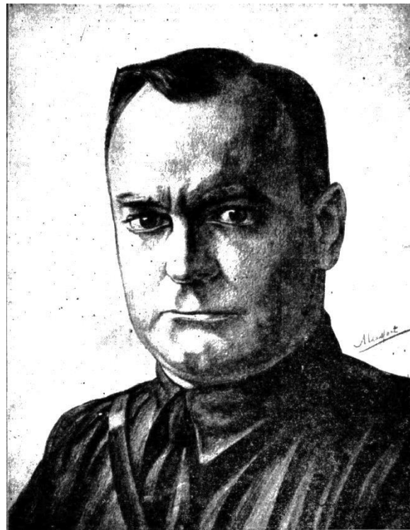
Figure 2. Portrait of Mussert by Meulendijk. VoVa , no 35, 1935.

In the guise of military commanders, the party leaders led marching columns through cities during rallies, 387 or subjected party branches to solemn reviews as if army regiments, letting the members march past as they theatrically saluted the columns from a platform. 388 Both leaders used standards as explicit symbols of their authority. From 1936 onwards Lindholm's presence was marked by a yellow-blue flag with a red Thyr rune (†), symbolising the self-sacrificing Nordic god of soldiers. 389 Mussert used a black standard, initially with the fasces , which was replaced (being 'too Italian') after August 1936, with a lion's claw grasping eleven arrows to mark his authority. 390 It was a simple, but evocative visual language which easily marked the men not as conventional party leaders or administrators, but something special, which allowed them to more effectively perform the role of natural Leader, and was seamlessly integrated with the militaristic myth of the party army [chapter 3]. In parties where part of the attraction was to be a missionary fascist soldier, military imagery could convincingly make a Leader for the cadres.