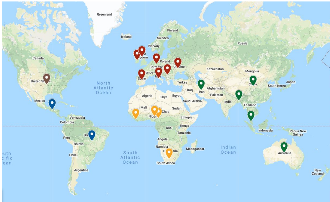
Figure 1: Regional distribution of responding HEIs

The majority of the responding HEIs were founded between 1900 and 2000 (15), while others were either founded between 1800 and 1900 (7) or following the year 2000 (5) making most of the cohort composed of fairly “new universities.” Only one university was founded before 1800.