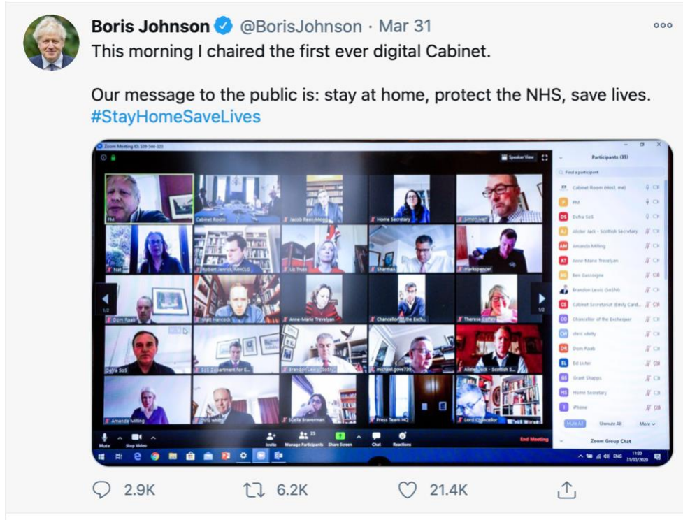
Figure 3: March 31 Tweet from Johnson

Similarly, Trump and his spokespeople emphasised that he continued to work throughout his illness, releasing as evidence two photos of the President wearing different outfits and sitting at different desks surrounded by documents and files (which, it later emerged, were taken ten minutes apart). One of these photos appeared in a tweet from his daughter, accompanied by the words: ‘Nothing can stop him working for the American people’ (Fig. 4).