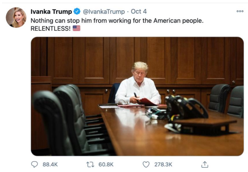
Figure 4: October 4 Tweet from Ivanka Trump

One feature that regularly appears in contingent narratives — the discussion of the possible cause of the narrator’s disease — is conspicuously downplayed in the stories of the two leaders, though this is an issue that preoccupied the media, given the reckless behaviour of the two men prior to their diagnoses (i.e. Trump’s refusal to wear a mask and Johnson’s bragging about shaking hands with COVID-19 patients). In the case of Johnson, no mention at all was made by either himself or his spokespeople about the possible connection between his behaviour and his condition. Trump, on the other hand, starting from his admission to hospital on October 3, began developing a storyline in which his infection was the inevitable result of his responsibilities of office: ‘I had no choice,’ he said in his October 3 speech from Walter Reed, ‘because I just didn’t want to stay in the White House. I was given that alternative. [...] I can’t do that. I had to be out front [...] As a leader, you have to confront problems’ (DT/Vid/3-10).