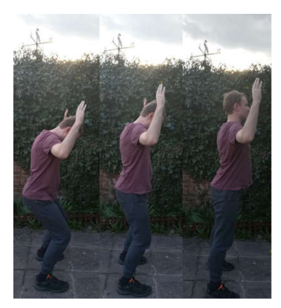
Figure 1. The Spinal Wave Sequence.

Unlike many postures in the syllabus (such as the all-important Wuji posture in the Neigong classes), this spinal wave is not given a Chinese term, but is nonetheless a cornerstone exercise for the class. It is normally used as part of the warmup after the basic limbering exercises, but it is also used to ease the body after prolonged periods of standing and form sequences. George has used this exercise not only in class but in between bouts of writing and marking, as an academic who uses his laptop for extensive periods of time while seated. He has heard clicks in different places across the spinal column (which are higher when the hands are raised), which have moved location throughout his two years