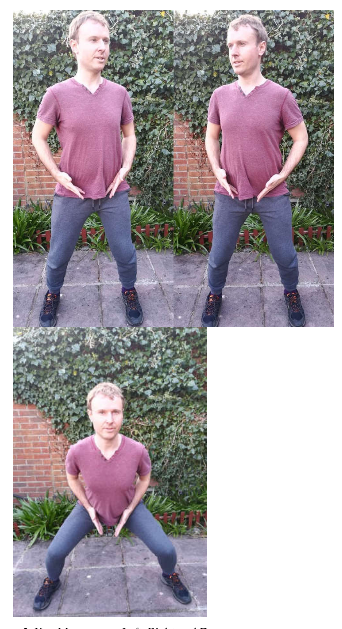
Figure 3. Kua Movements: Left, Right and Down.

Sometimes in class, students do perform contemporary fitness exercises such as crunches, the plank and brief press-ups for general fitness and to get into "the zone" for training. However, in the main part of the sessions, these seemingly Western exercises are absent, as the tuition focuses on generic Daoist physical cultural and medicinal concepts. "Kua squats" turns the familiar "Western" exercise of (bodyweight) squats into a more Chinese Daoist form of movement. As with some of the shoulder loosening exercises described above (as in the upper row of Figure 2), we move up and down according to three different heights—transitioning from a lower extremity to a middle point and then an upper position. This continues with the trend of pulling up the head from the occipital bone and lowering the tailbone with one's intent (Yi). So, when one moves down from the Kua (as opposed to the knees), the head is still pulled up in order to continue with an erect spinal column.