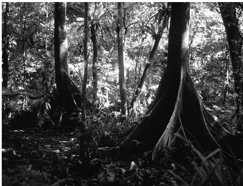
PLATE 1. Undisturbed freshwater swamp-forest in the lower catchment of the Yela River, Kosrae, Federated States of Micronesia. This frequently flooded forest type, dominated by the Micronesian endemic Terminalia carolinensis (buttressed roots), is found just landward of Kosrae's thick mangrove belt.

In response to these problems, Phillips and Gregg (2003) developed and recently introduced mixing model software (IsoSource) that is designed for situations in which n isotopes are being used and more than n + 1 sources are likely to be contributing to a mixture. IsoSource uses stable isotope data to calculate feasible ranges of source contributions by the following procedure. First, all possible combinations of source proportions that sum to 100% are calculated in user-specified increments (usually 1%). Second, the predicted isotope values of each mixture are computed using linear mixing model equations that preserve mass balance (Phillips 2001). Isotope values of computed mixtures are then compared with the observed isotope values; the range of combinations that match within a user-specified tolerance value (e.g., 0.1‰) is then described.