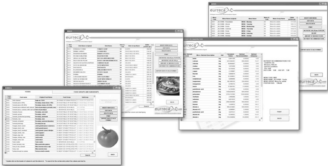
Figure 2 Screen prints of modules for foods, dish recipes and menus.

The second module is the calculation of dishes, meals and menus module (2) . The aim of this module is to calculate the nutrient composition of different dishes, meals and menus. The possibilities of the different submodules are listed below: