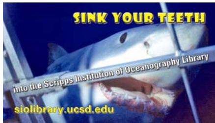
Fig. 1 – Promotional magnets

These gift certificates were very popular. The Cups coffee shop is conveniently located adjacent to the library, a nice redwood deck with a great view and wireless access, offering coffee, juices, lunch salads and sandwiches, and snacks. Students are invited to bring their food & drinks into the library.