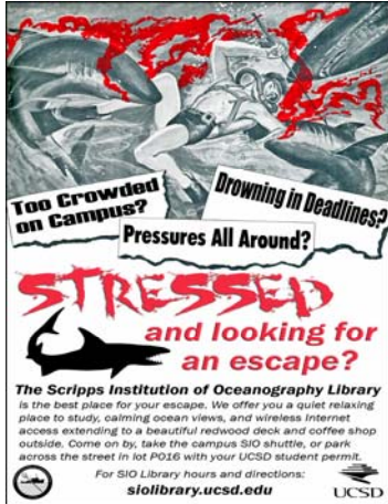
Fig. 2 – Ad in campus newspaper

the ad size was reduced a little, but color was maintained, and an additional ad placed a little earlier in the quarter.