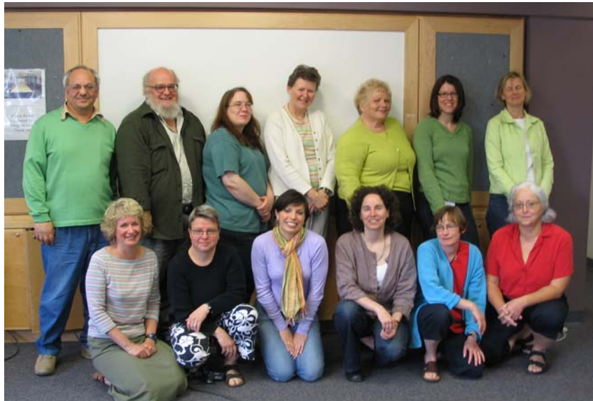
Figure 4: 2006 COFOL meeting, Bedford Institute Oceanography, Dartmouth, NS