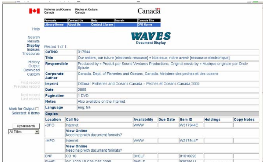
Figure 5: a WAVES record

Another example of the cooperation and shared responsibility is COFOL's approach to collection development. Each library is a Primary resource centre for legacy print materials and agrees to maintain these materials on behalf of the network.