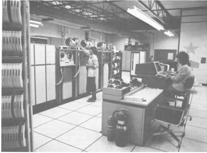
Figure 1: The Institute of Ocean Sciences Library Book Catalogue was housed in the Central computing department