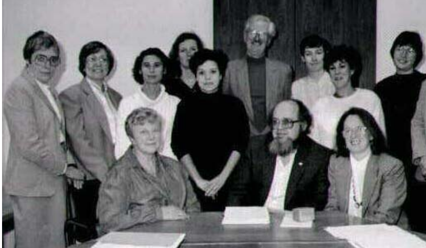
Figure 3: 1987 COFOL meeting, National Capital Region, Ottawa, ON

financial resources. There also have been some organization changes. In the Maritimes, management of all the region's libraries was consolidated.