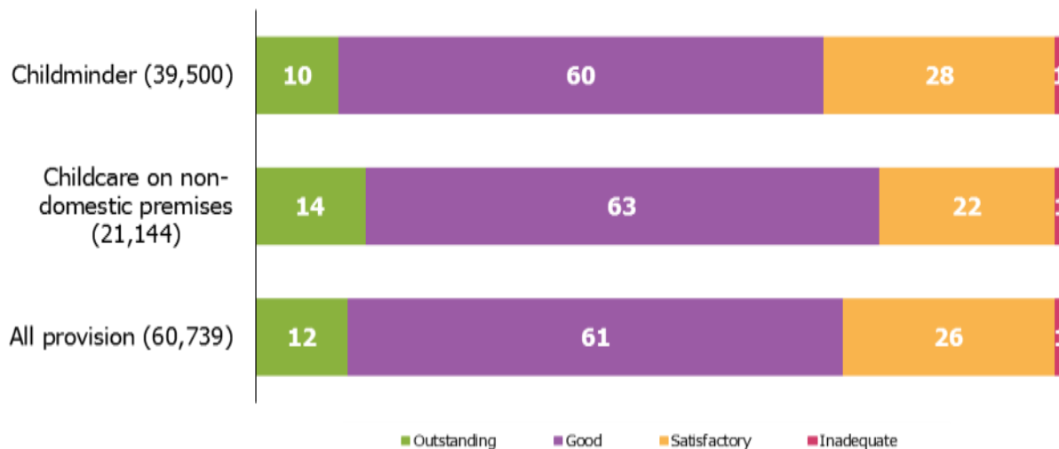
Chart 2: Overall effectiveness of active early years registered providers at their most recent inspection as at 31 December 2011, by provider type (provisional) 1 2

1. Percentages are rounded and do not always add exactly to 100.