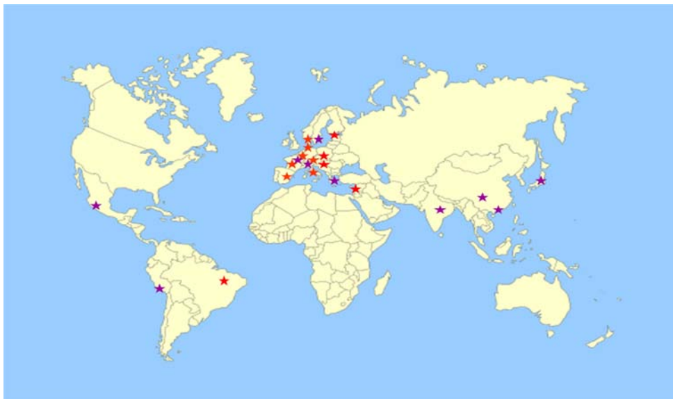
Figure A1. Countries scoped for Phase 1 report*

*Initial information was gathered about countries highlighted with a purple star, but only those highlighted with a red star were included in the initial scoping report.