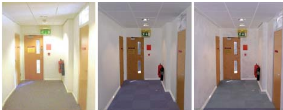
Figure 8: Believable realism – photograph (left), computer graphics (middle) and graphics with scruffy enhancements (right).

A key challenge in creating realistic virtual environments is accurately modelling avatars. Although attempts are made to create believable avatars, most fail owing to the uncanny valley phenomenon in which the avatar is ‘almost human’ but because it is not ‘fully human’ and humans are particularly sensitive to the appearance of other humans, the avatar appears ‘strange’ (Mori, 1970).