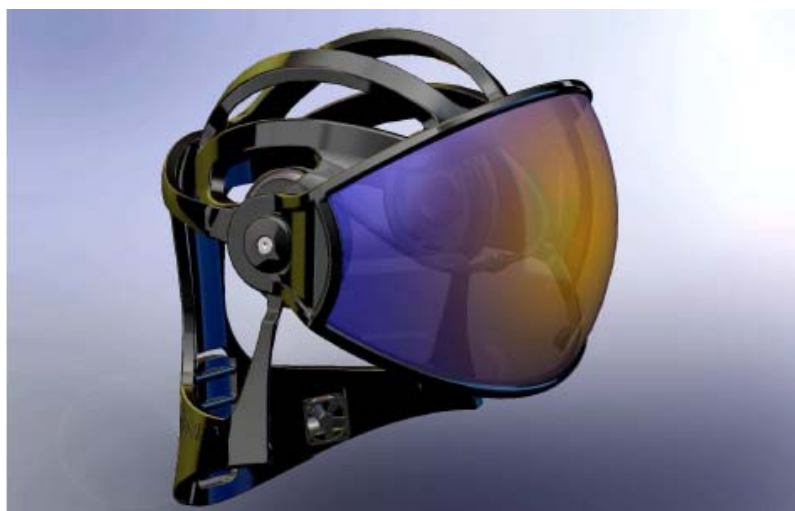
Figure 6: The virtual cocoon

Real Virtuality thus delivers an experience that is perceptually equivalent to the real-world experience, without the need to compute full physical accuracy. The delivery mechanism of Real Virtuality is termed a 'virtual cocoon'. This is a helmet-like device that contains high-quality visuals, 3D audio headphones, smell and tasting technology, and temperature, humidity and wind simulation devices (Figure 6).