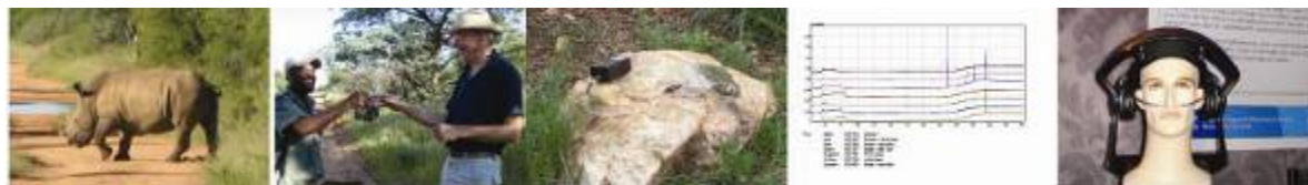
Figure 5: Capturing and delivering real-world smells