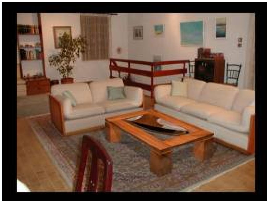
Figure 2: A virtual coffee table placed in a real room