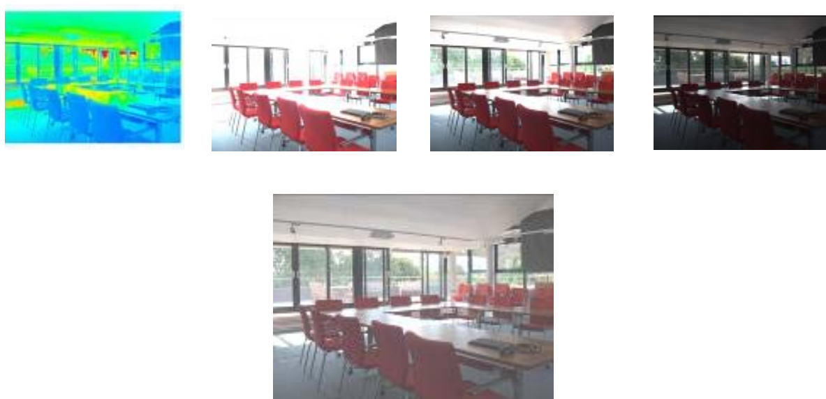
Figure 4: HDR imaging (left) False colour image showing the dynamic range magenta=2,000 lux and light blue=3.8 lux (right) – three images at different exposures and (bottom) tone-mapped HDR image shown on LDR display.