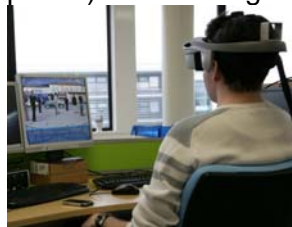
Figure 1: User wearing an HMD with head tracking; the computer monitor shows what he is seeing

Worn on the head of a user, an HMD provides an immersive visual experience by delivering images to one (monocular) or two (binocular) displays directly in front of a user’s eyes. Combined with some form of head tracking, such devices enable a user to ‘look around’ a virtual environment. These displays have typically comprised LCDs, but more recently OLED technology (which has more contrast and requires less power) is becoming common.