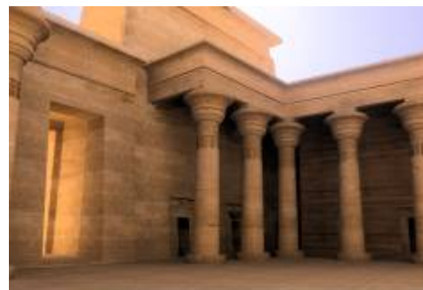
Figure 7: Temple of Kalabsha (left) today and (right) as it may have appeared in 30BC

So, for example, in Figure 7, the sights, sounds, smells, temperature of the Temple of Kalabsha near Aswan in Egypt, could be simply captured and delivered to enable a user to experience the temple as it appears now. However, if we want to experience the temple as it may have appeared in 30BC, then a computer model is necessary to simulate accurately each of the senses of the temple in the past (Sundstedt et al. , 2004).