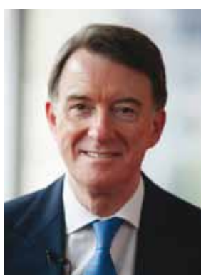
Peter Mandelson Secretary of State for Business, Innovation and Skills

Skills are a key part of our plan for economic recovery and, as such, an urgent challenge. This country's future can only be built by educated, enterprising people with the right skills; the skills demanded by modern work in a globalised knowledge economy. Skilled people are more productive, they are more innovative, and they build stronger businesses.