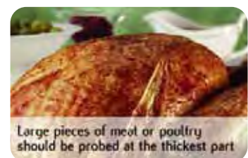
Large pieces of meat or poultry should be probed at the thickest part