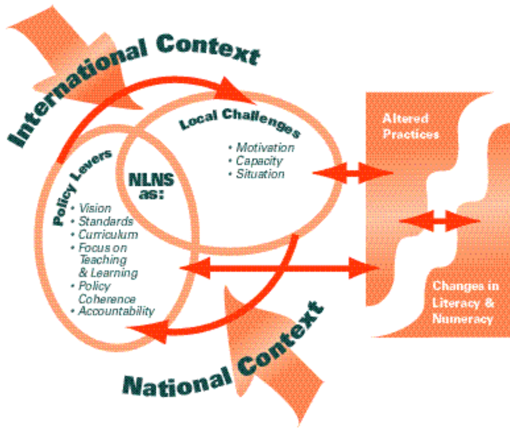
Figure 1: The Framework Guiding the External Evaluation