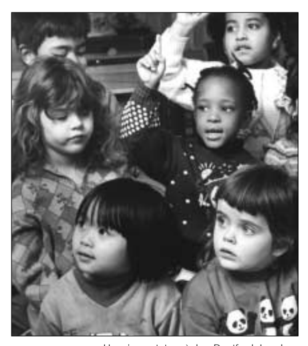
Housing estate crèche, Deptford, London.

The following sections give guidance on how a global dimension can be incorporated into teaching, in ways that ensure progression through the key stages and relate to, and develop, the National Curriculum and religious education.