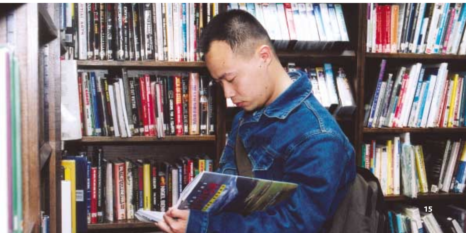
Promoting reading.