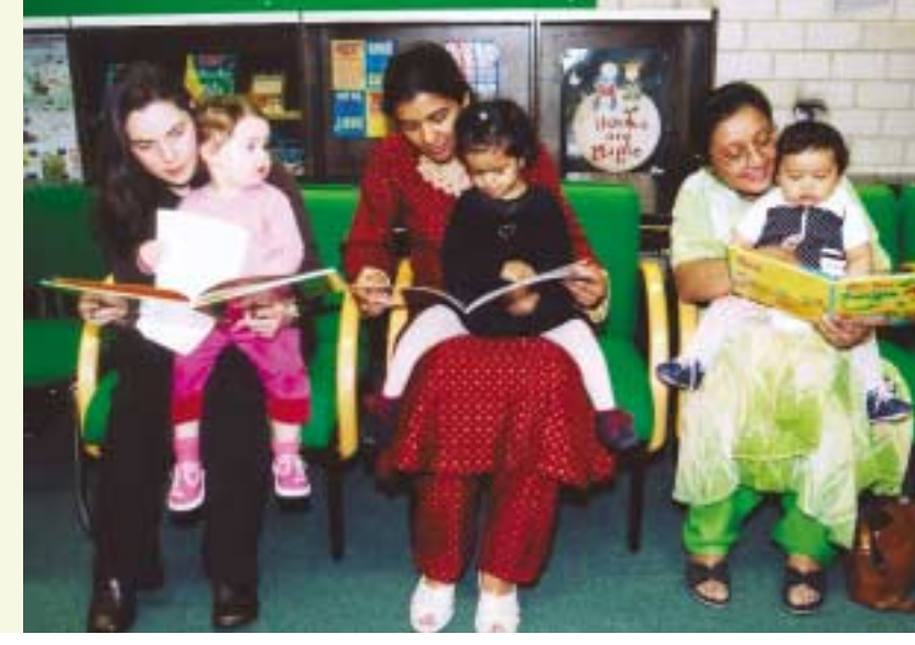
Supporting early learning.

Libraries are such a part of our way of life that it is easy to take them for granted. More people go to libraries than cinemas. Visits to libraries outnumber visits to professional football grounds.