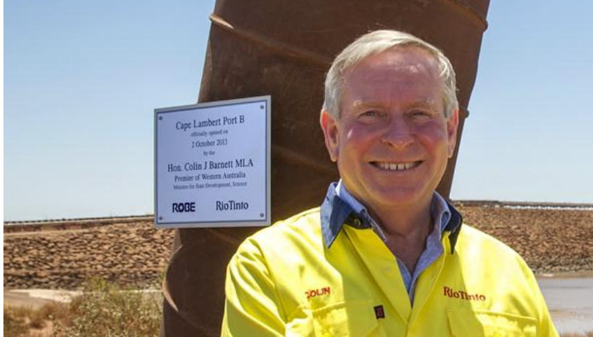
COLIN BARNETT Liberal, WA lower house Premier and Minister for State Development

I've got a great affection for Onslow. Some people in the town might remember that I was the Minister that played a role in the development of the Onslow Salt project, which nearly failed after two cyclones hit.