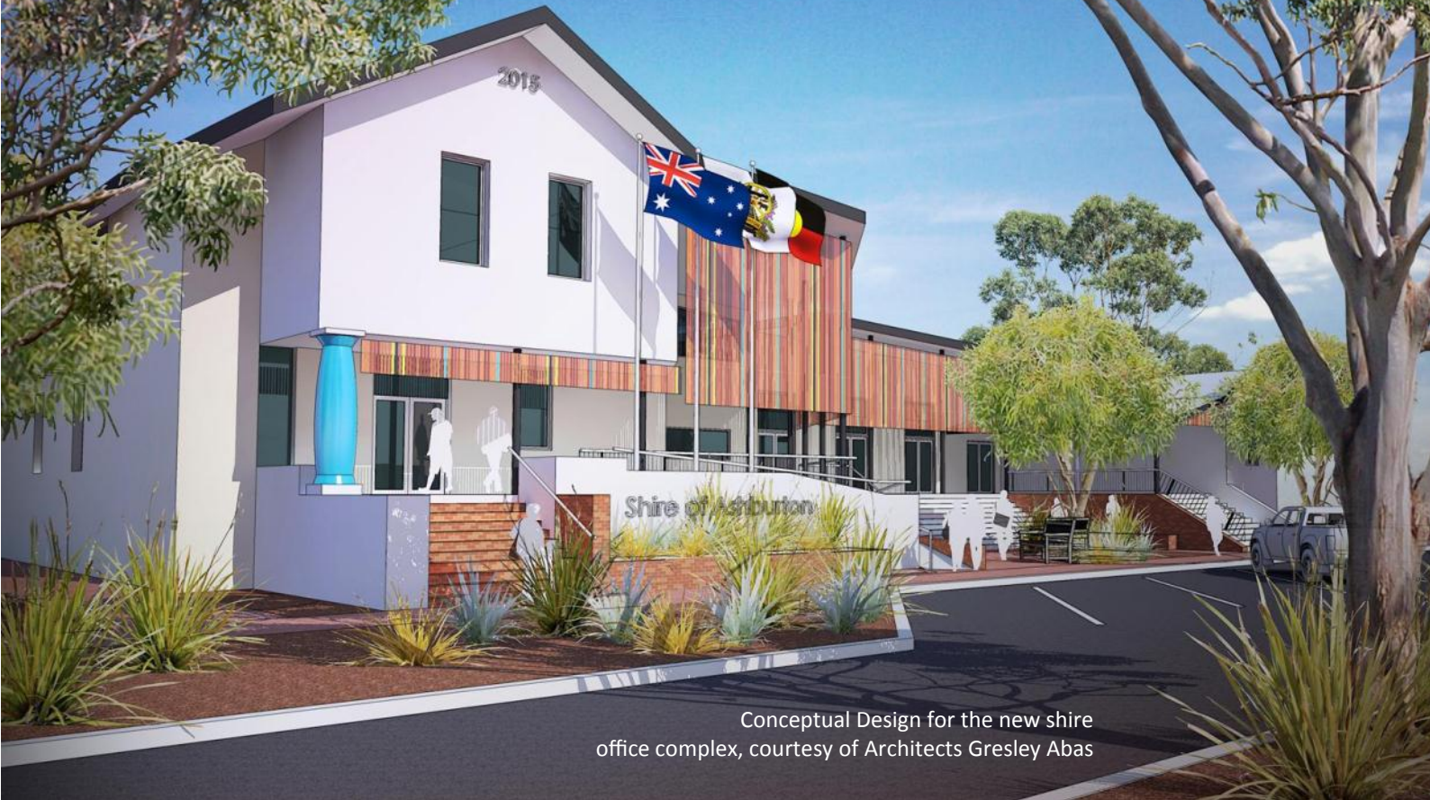
Conceptual Design for the new shire office complex, courtesy of Architects Gresley Abas

The budget of $9.5 million was agreed upon following the acceptance of his Concept Design Plans by the Council.