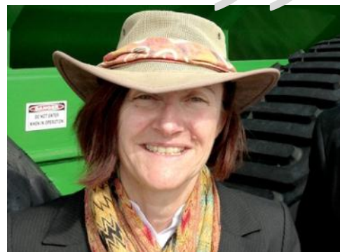
RACHEL SIEWERT Greens Federal Senate Member for WA Portfolios: Indigenous Issues; Rural Affairs; Community Services, Marine

We are committed to ensuring investments are made across regional WA to keep towns like Onslow strong, well beyond the short term mining boom, and we welcome discussions about these important issues.