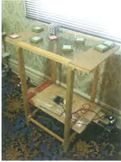
Figure 2.1: Interactive music system

Like the reacTable , my instrument incorporates a clear tabletop with a camera placed beneath, which constantly examines the table surface, tracking the nature, position and orientation of the tangibles, or objects, that are placed, and moved around, on it. The tangibles display visual symbols, called fiducials (see Figure 2.2), which are recognised by the software. Each tangible is dedicated a function for generating or manipulating/controlling a sound. Users interact by moving them around the tabletop, changing their position, their orientations, or their faces (in the case of, say, a cube object) (S Jorda, Kaltenbrunner, Geiger, & Alonso, 2006; S Jorda, et al., 2005).