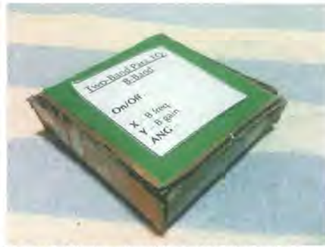
Figure 2.10: Two-Band Para. EQ: B-Band object

One way to create new and different timbres using the instrument is to work with the Two-Band Parametric EQ objects. This allows the player to emphasise certain frequencies while removing undesired ones, along with creating a range of effects in performance time, such as EQ sweeps. To make full use of this EQ effect, two fiducials, attached to two separate objects, are required: Two-Band Para. EQ: A-Band (see Figure 2.9) and Two-Band Para. EQ: B-Band (see Figure 2.10). The recognition of the first fiducial, or object, entitled Two-Band Para. EQ: A-Band switches the EQ on, while the removal, or de-recognition, switches it off. This means that even if the second EQ object, Two-Band Para. EQ: B-Band , is on the tabletop, in full view of the camera, and only the first EQ object is removed, the EQ will still be switched off. It also means that the second EQ object cannot be used to switch the EQ on in the first place.