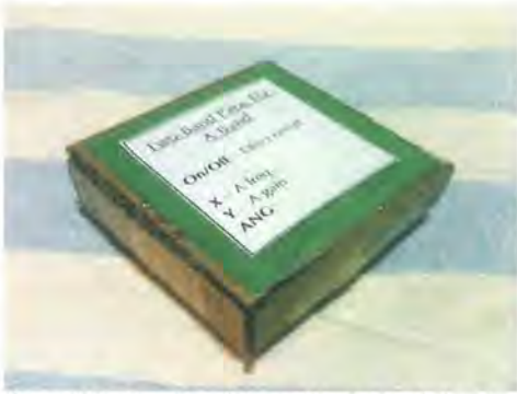
Figure 2.9: Two-Band Para. EQ: A-Band object