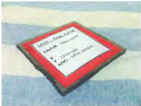
Figure 2.8: LFO2 to Amplitude cut-off object

The rotation, or angle of the object controls the amount of how much the LFO affects the original note. A rhythmic pulsing effect is established if the LFO amount is low, while there is a more “wobble-like” effect if the LFO amount is higher.