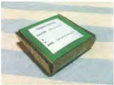
Figure 2.11: Digital Reverb object

A parametric EQ uses independent parameters for centre frequency, gain amount (which have both been mapped to the x and y values of the objects) and Q, which is the width of the affected area around the set centre frequency. I have not set the instrument up in a way to control the Q, however, and have left it as a pre-set at a medium width (Nordmark, 2007).