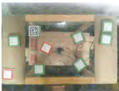
Figure 2.4: Tabletop interface