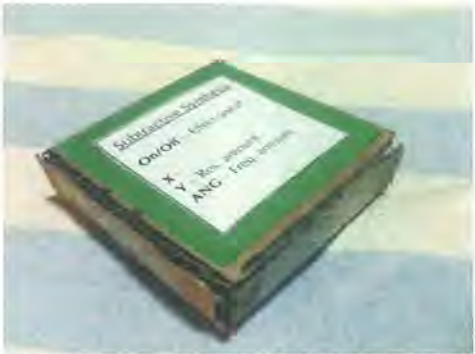
Figure 2.14: Subtractive Synthesis object

Another form of synthesis that can be used to explore further timbre possibilities is that of subtractive synthesis, which essentially is the method of removing harmonics. This can be achieved by placing the Subtractive Synthesis object (see Figure 2.14) on the table, and in turn activating a bandpass filter. As always, the removal of the object deactivates the filter.