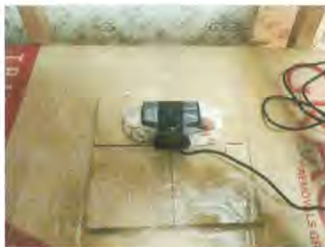
Figure 2.5: Camera