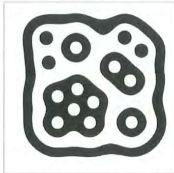
Figure 2.2: Fiducial symbol

Like the reacTable , my instrument incorporates a clear tabletop with a camera placed beneath, which constantly examines the table surface, tracking the nature, position and orientation of the tangibles, or objects, that are placed, and moved around, on it. The tangibles display visual symbols, called fiducials (see Figure 2.2), which are recognised by the software. Each tangible is dedicated a function for generating or manipulating/controlling a sound. Users interact by moving them around the tabletop, changing their position, their orientations, or their faces (in the case of, say, a cube object) (S Jorda, Kaltenbrunner, Geiger, & Alonso, 2006; S Jorda, et al., 2005).