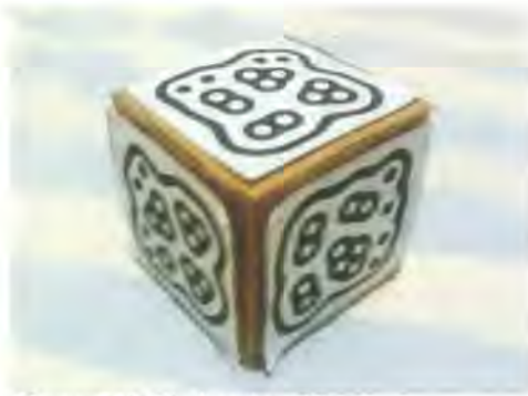
Figure 2.6: Pitch cube object

The pitch produced by the instrument is generated and controlled by the pitch cube object (see Figure 2.6). Each of the six faces sets off a different pitch when placed on the tabletop, and in view of, and recognised by, the camera. The six pitches that can be produced, when the relative face is firstly recognised, are each the note of C, however, all are in different octave ranges. The notes are created by a square-wave tone generated by a single oscillator. When the cube object is removed from the tabletop, the note stops. It is possible to create chords of two and three notes using the pitch cube by angling it in a fashion so that the camera can see and recognise the two or three faces, generating the relative pitches simultaneously. Not all combinations of two or three notes are possible to create, only those that can be generated by fiducials on adjoining cube faces.