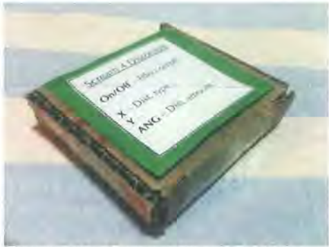
Figure 2.12: Scream 4 Distortion object

The only parameter of the reverb open to manipulation is the dry/wet amount, controlled by the rotation of the object. This is the balance between the audio signal (dry) and the reverb effect (wet). The x and y axis' of the object do not control any parameter. The other parameters of the reverb device remain pre-set. These include the algorithm – represented by 'type of room' on device; size – emulated room size; decay – length of reverb effect; and damp – cuts off the high frequencies of the reverb.