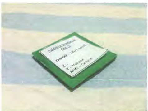
Figure 2.17: Additive Synthesis Osc 3 object

The three Additive Synthesis objects can be used separately, or for a more effective result, simultaneously, to form a complex tone. The placement of each object on the tabletop interface switches on its own oscillator, and the removal of each switches the relative oscillator off. The main function of the objects is to add overtones to the original pitch, and thus create an additive synthesis effect. Each oscillator produces the same note as is currently being generated (i.e., the note determined by the pitch cube). This means that if the pitch cube is raised on its y-axis and thus the pitch of the original oscillator's square wave rises, the pitches of the notes produced by the Additive Synthesis oscillators will also rise in unison. Each oscillator produces a different type of waveform; Additive Synthesis Osc 1 (see Figure 2.15) produces a sawtooth wave, Additive Synthesis Osc 2 (see Figure 2.16) produces a square wave,