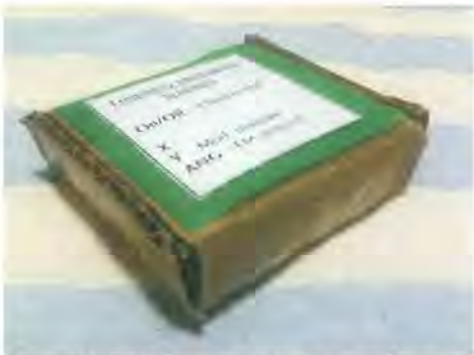
Figure 2.13: Frequency Modulation Synthesis object

While the y-axis of the object is invalid, the angle, or rotation, controls the amount of distortion. While raising the amount of distortion, or damage, the master level may need to be lowered in order to maintain the same output level, and vice-versa.