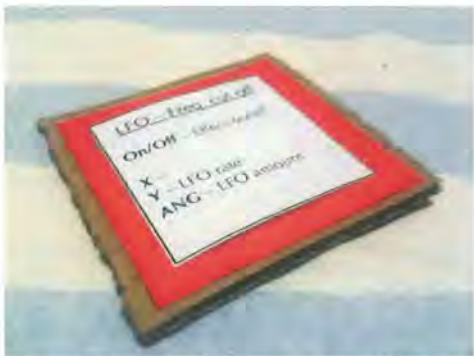
Figure 2.7: LFO to Frequency cut-off object

The objects in the category of rhythm generation/control can be identified as red, flat objects (7cm x 7cm).