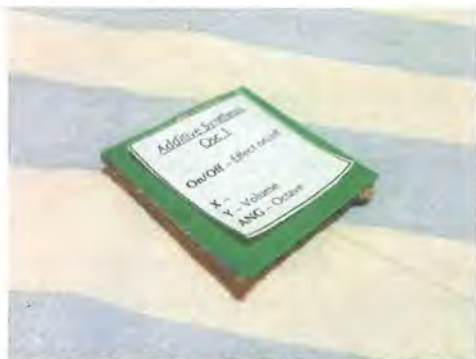
Figure 2.15: Additive Synthesis Osc 1 object