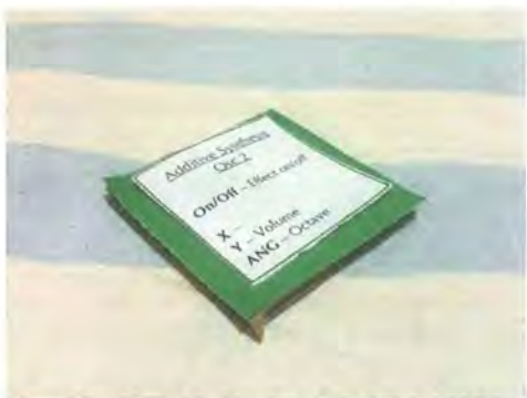
Figure 2.16: Additive Synthesis Osc 2 object