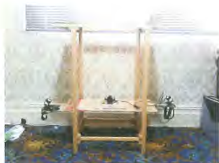
Figure 2.3: Table design

As the instrument bares a tabletop interface, I found it rather appropriate that its entire physical structure – wooden frame – be based on the shape and design of a table (see Figure 2.3). The table stands 92cm high, at perfect mid-stomach height. As it is intended to be performed while standing up, this gives the performer a “birds-eye” view of the tabletop, while relieving them from having to bend or sit down to move the objects around. The dimensions of the tabletop interface – clear Perspex – are 46cm (length) x 37.6cm (width) (see Figure 2.4). This provides the performer with quite a large area ( 1729.6\text{cm}^2 ) to move the objects around. As part of the design, on either side of the interface are two 15cm x 46cm shelves intended for the objects to rest on.