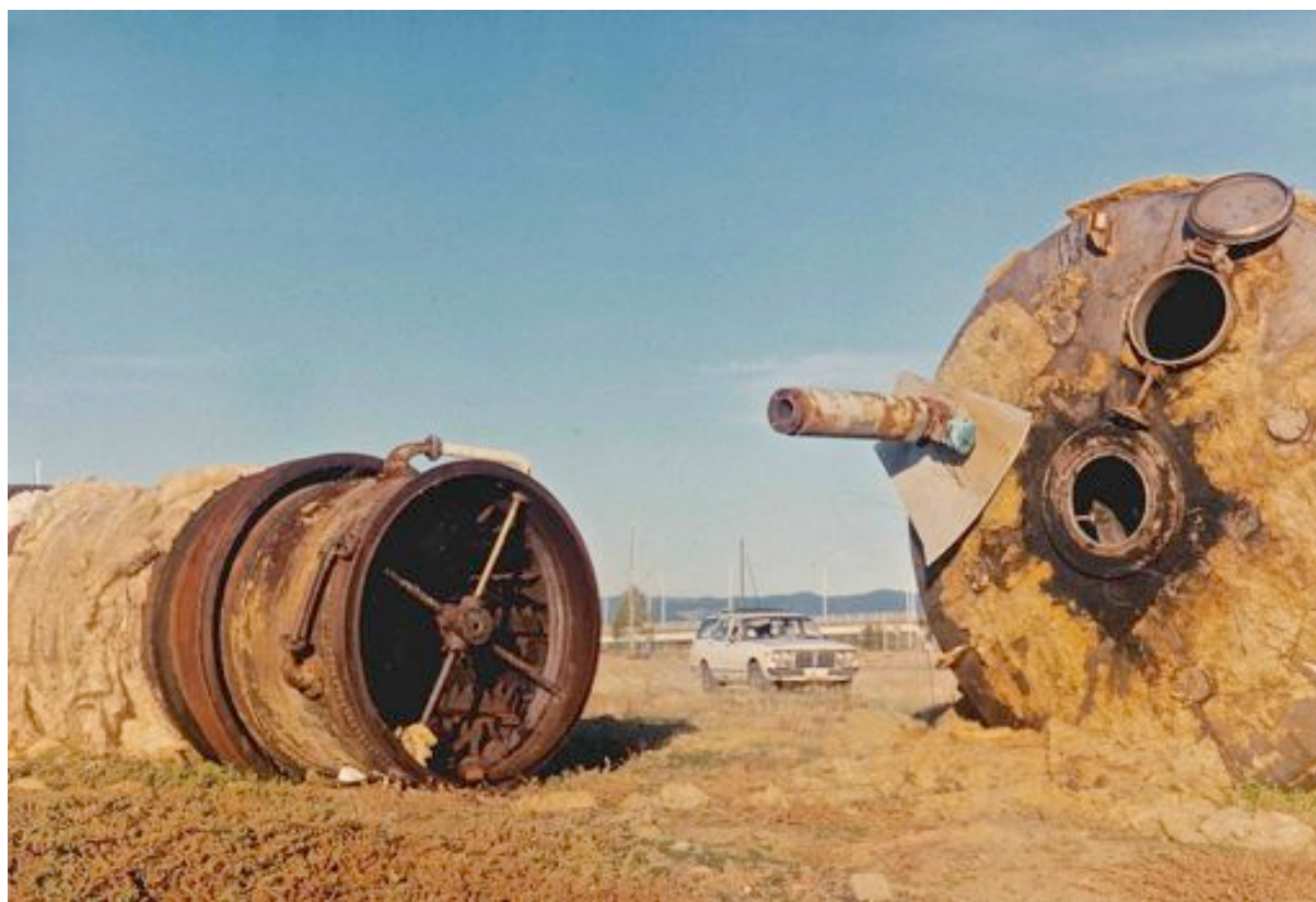
Figure 3 Rusty hoppers left on Lartelare's site after the demolition of the CSR Refinery. Schultz made recordings in and around the hoppers.

The following track, "Ground Water, Sea Water," depicts the swirling fluvial debris of a century of construction and deconstruction. One is riveted to sit still and listen.