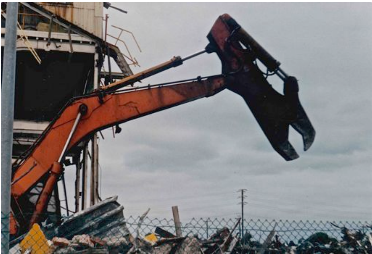
Figure 2 One of the huge machines of demolition at the CSR Sugar Refinery at Glanville, January 1993.

“Islands of Quietness,” to revisit my epigram—are “rarely included in the equations of urban developers.” “The Beasts of Babylon” (Track 11) references the “ruined City,” a spiritual metaphor from The Revelation of John: “Babylon the Great is fallen.” 76 This recurring motif in Schultz’s work is generally inclusive of people who live on a city’s margins. However Within Our Reach extends the metaphor to the natural environment on the margins including the arboreal habitats of sparrows and pigeons destroyed in the ensuing acoustic disaster. Schultz was quick to photograph and record the overbearingly loud, clanking cranes and other hard-shelled industrial machines (Figures 2 and 3) that demolished the Sugar Refinery in January 1993, following on from its closure in 1991. Track 11 graphically depicts one “beaked monster” grabbing huge scraps of metal while a sewage pipe pisses 37 million litres of effluent (daily) into the river at the Causeway where the Reach was “beheaded.”