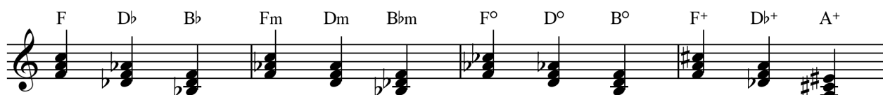
Figure 2.1a: Taking F as the pivot note

For example, hearing the note ‘F’ not only as the first degree of an Fmaj7 chord, but also as the third in a Dbmaj7, the fifth in Bbmaj7, etc. This goes for all chord types, but beginner practitioners should limit themselves to practising the four triads (major, minor, diminished and augmented). With three chord tones (first, third or fifth), and four triad types, there are then 12 different triads which can involve just one distinct pivot tone (figure 2.1a).