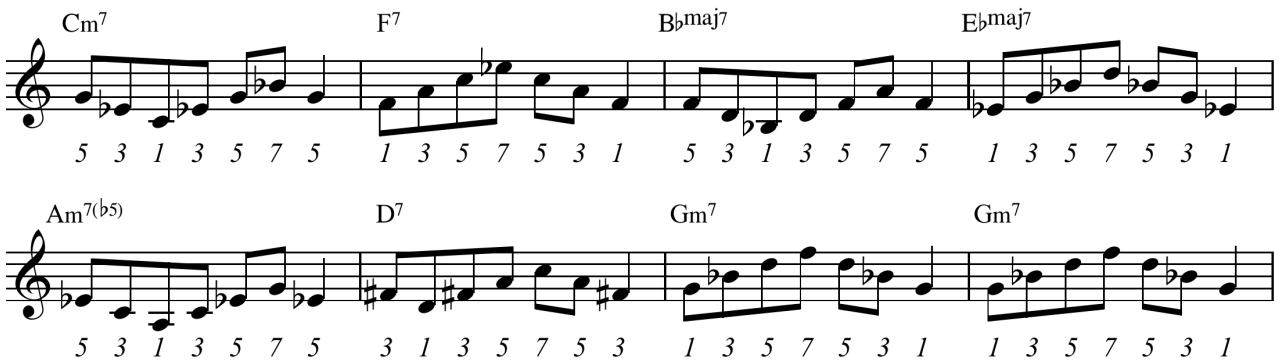
Figure 2.4b: The first eight bars of 'Autumn Leaves' with the pivot system shapes substituted.

Taking these pivot notes as the starting point, the practitioner would then substitute the appropriate shapes in place.