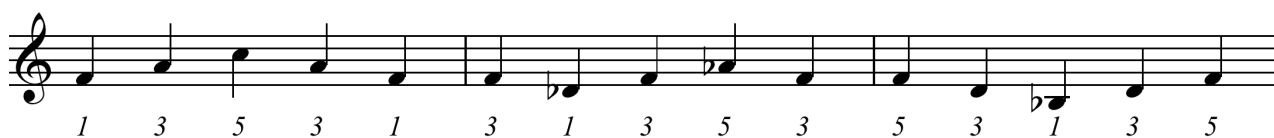
Figure 2.1b: Shapes used in the practice of the pivots system.

As Bollenback shows, there is a set of “shapes” devised which are sung and learnt, that have the pivot note functioning as the root, third or the fifth respectively, of the given chord 99 . Figure 2.1b shows these shapes for the basic major triads possible.