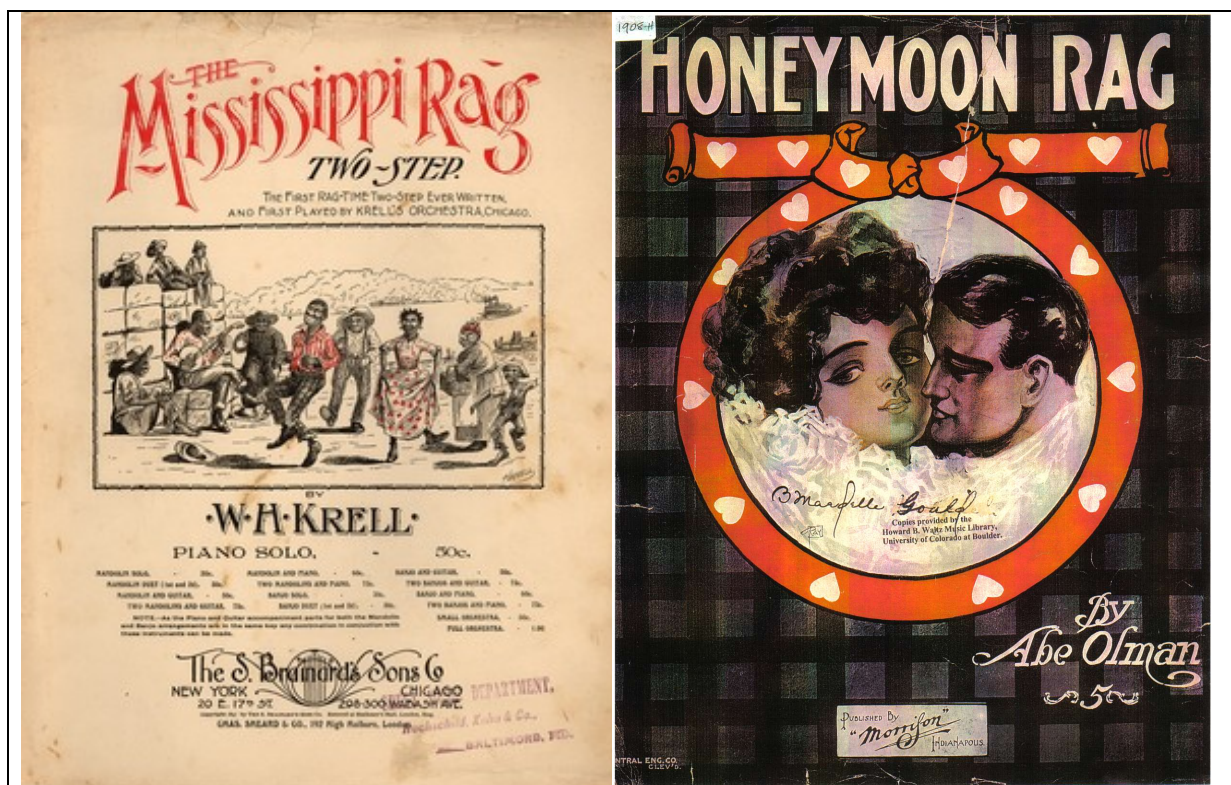
Figure 17. Racial Typecasting The Mississippi Rag (published in 1897)

As time progressed, there was a dramatic shift in the acceptance of Ragtime as an exclusively Black ‘exoticism’ 77 , to being categorised as white popular music. This is evident in the diminishing racial emphasis in publications of Ragtime music in the early twentieth century. A comparison between 1902, where the vast majority of rag publications made reference to the race and colour of its exponents, to 1904 shows a profound difference in the frequency of racial typecasting, beyond which 5% of publications or less followed this trend 78 .