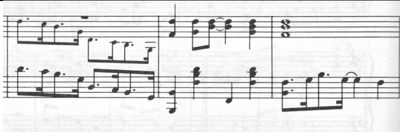
Figure 16. Dance-influenced Ragtime Euday L. Bowman's 12 th Street Rag

the necessity of writing in a popular idiom had a salutary effect in clarifying his melodic line” 75 .