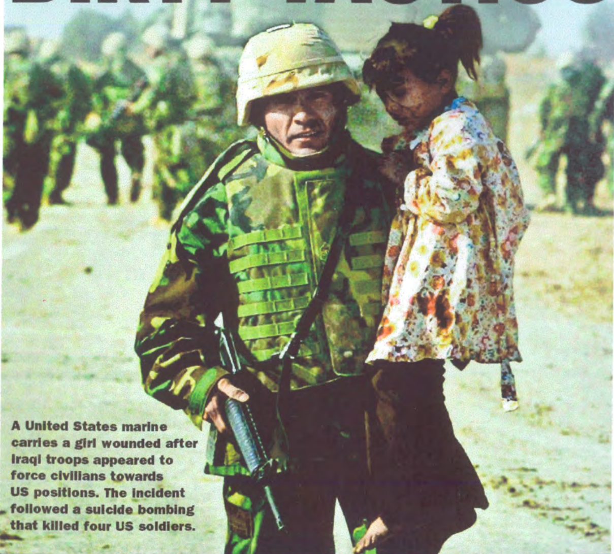
A United States marine carries a girl wounded after Iraqi troops appeared to force civilians towards US positions. The incident followed a suicide bombing that killed four US soldiers.

SAS on the front line, page 3 Syria, Iran warned, page 4 Iraq's poison queen, page 5