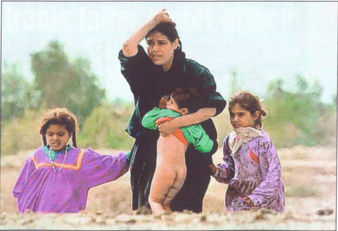
Slipping away: A woman almost loses her grip on her baby as she frantically tries to lead her family away from the bullets of Iraqi militiamen outside Basra.