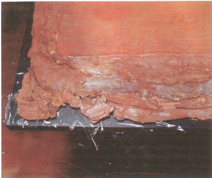
Figure 15: Eva Hesse, Augment , 1968 (detail). Latex and filler over canvas.