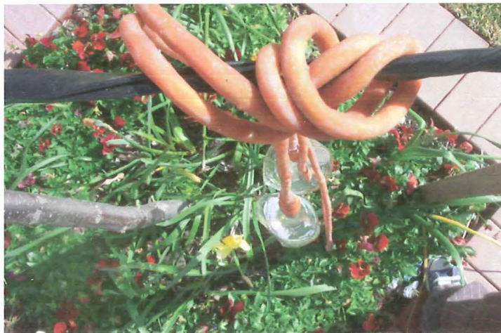
Figure 11: Photo Documentation. Untitled , 2004.

By combining glass and latex the relationship between the blown objects has successfully captured the ideas and concerns relating to trace, childhood and domesticity but ambiguity and an element of humour is present allowing for possibilities and the viewer to bring potential to the work.