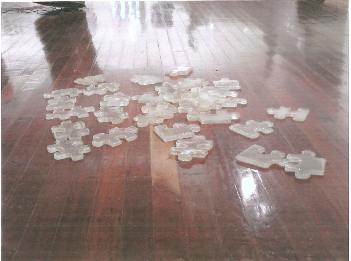
Figure 1: Untitled (glass jigsaw puzzle), 2004. Dimensions variable.