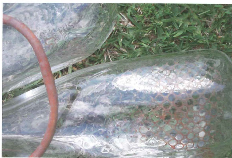
Figure 10: Photo Documentation. Untitled , 2004.