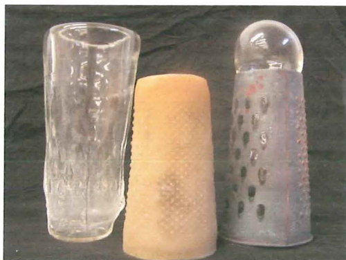
Figure 5: Untitled , 2004. Blown glass, metal, wax.

Once found, these objects may become part of a work. They may be manipulated in some way, dismantled, recreated in several new materials therefore taking on new associations and lives. The item may become a mould to create a new object or process.