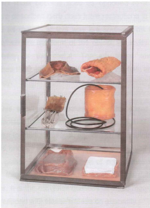
Figure 16: Eva Hesse, Untitled , 1967-68. Mixed media in a glass and metal case. (37.1x26x26cm)