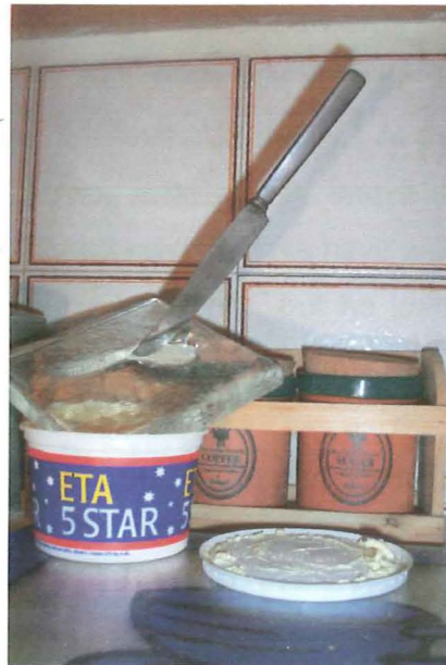
Figure 20: Breakfast 2004 . Glass and found object.

The combination of these materials in this manner is non traditional therefore this process has quite a degree of chance to it. The glass carries associations of preservation and trophy like connotations and the item now embedded in its new home appears as an ornament that should adorn the top shelf, though the object, an old iron is identifiable. The function of it is removed and it is both funny and absurd in its new state.