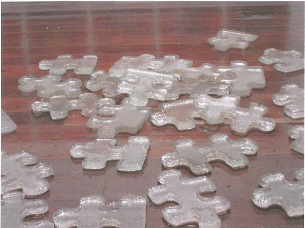
Figure 2: Untitled (glass jigsaw puzzle), 2004. Detail.