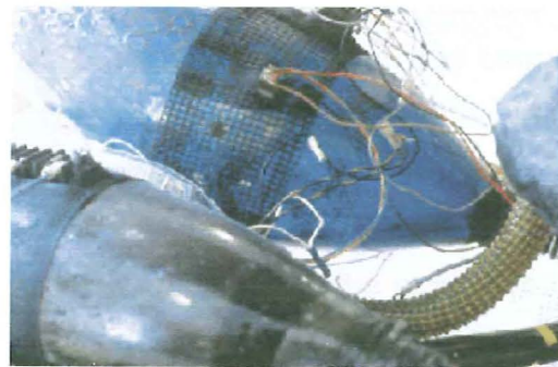
Figure 9: Walter Zimmerman. Safety Yellow (detail). Hand blown glass and mixed media, 1996