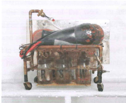
Figure 8: Walter Zimmerman. Urban Unit #3 (Red) . Hand blown glass and mixed media, 1999