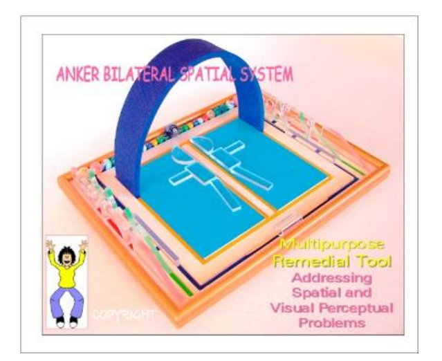
Figure 1. The Anker Bilateral Spatial System. A bilateral board, an arc representing the intervention space, geometric shapes, and marbles of varying size allow players to manipulate designs in a two or three dimensional plane.

(Murphy & Spencer, 2009). There are very few manipulative or electronic games with which a child can become physically involved in manipulating game shapes or building shapes in a three-dimensional level while simultaneously developing their depth and spatial perception. This lack of a comprehensive visual-spatial and visual-motor remediation program led to the development of the ABSS (see Figures 1 and 2).