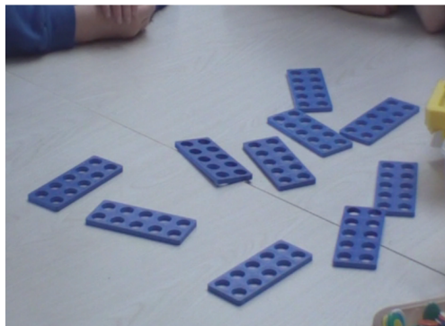
Figure 2: Ten 10-piece Numicon