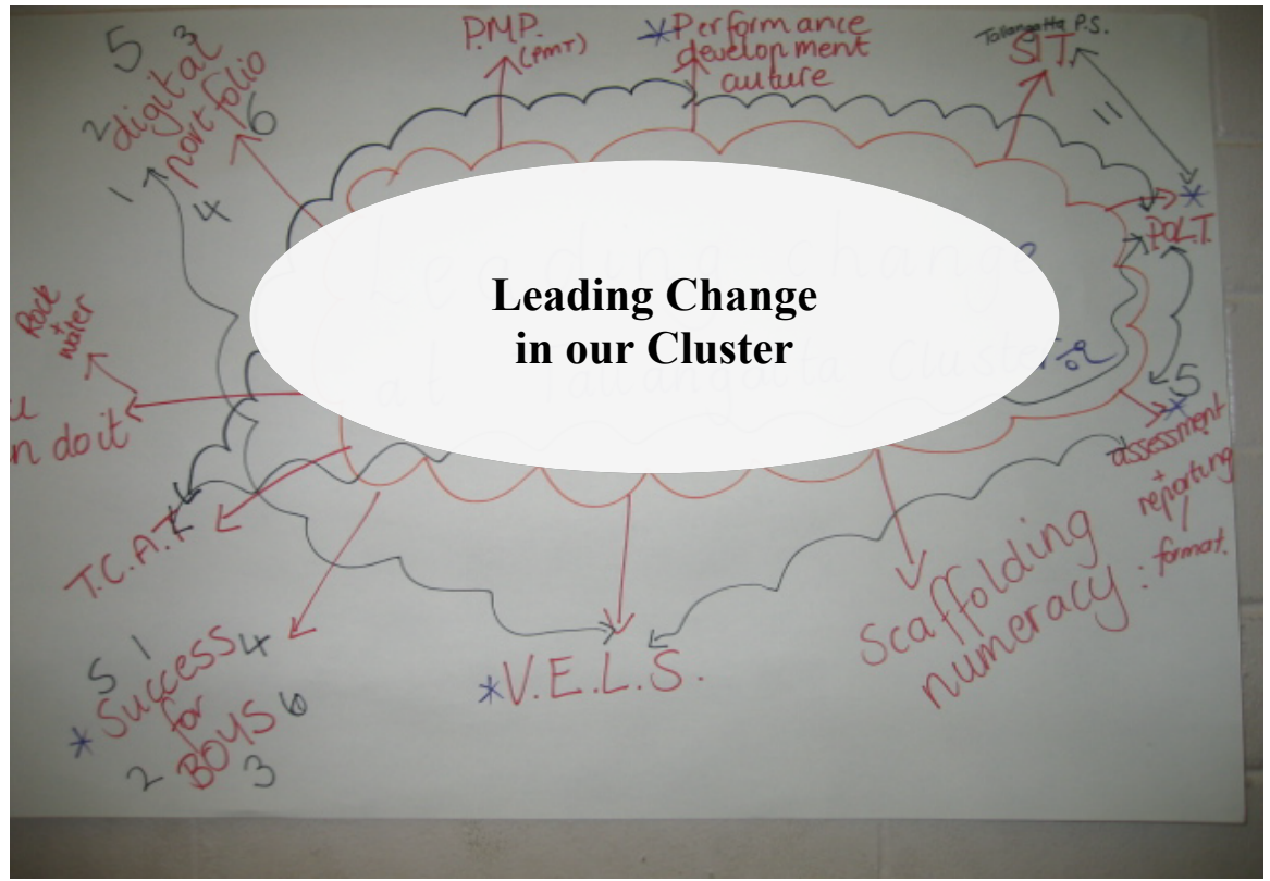
Figure 2: Leading Change. Cluster - Rural Region Victoria