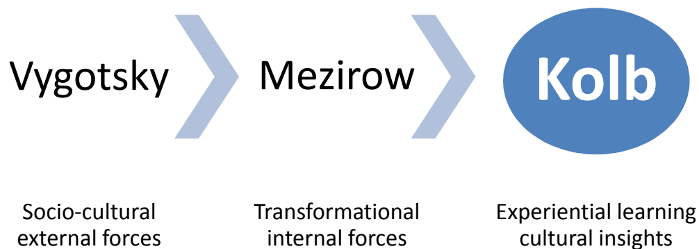
Figure 1: Theoretical Foundation for Study Design

Professional learning requires the complex task of transforming acquired knowledge into applied knowledge. To better understand how the participants in this study were making this transformation a theoretical model of learning was developed to better understand the cross-cultural experience. As shown in Figure 1, the model drew upon the experiential learning theory (ELT) (Kolb, 1984) and was supported by the foundational work of Mezirow (1981, 1991, 1994) and Vygotsky (1930-1934/1978).