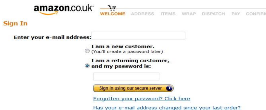
Figure 2 Amazon's Checkout Window

The two ceremonies are analysed in previous work (Bella and Coles-Kemp, 2011) using the HCI cognitive walkthrough method (Wharton et al., 20114) to give an idea of technological practice and compare the outcomes of technological practice analysis with security protocol analysis of the same ceremonies. The analysis resulting from the HCI cognitive walkthroughs showed that registration and purchase services are separate ceremonies and can happen independently of each other. The analysis in Bella and Coles-Kemp's 2011 paper shows that the user continuously faces a registration invitation on each page but if the user defers registration, then they will be compelled to register to finalise the purchase, as the interface illustrated in Figure 2. Analysing the walkthroughs showed that, in terms of security, this separation can result in the Amazon user not realizing the significance of the password and setting a weak one even though it is used to protect the user's credit card number while it is stored with Amazon. The walkthrough analysis also showed that the privacy issues are related to Amazon storing not only the shopping preferences of registered users and thus effectively profiling them, and also through the storing of the preferences of unregistered users by linking click patterns to IP addresses.