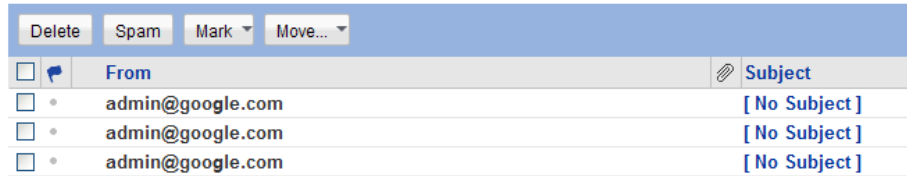
Figure 3 - Inbox from Yahoo mail, showing variance in homoglyph characters.

character. Finally examination of the Thunderbird and Yahoo clients show the homoglyph character in a slightly different manner, an example of this is shown in figure 3.