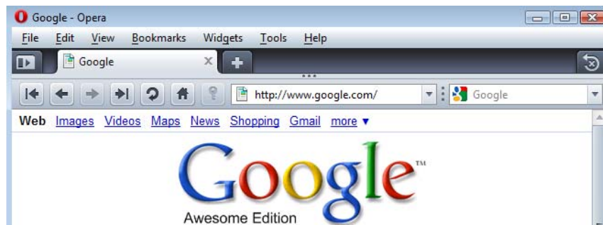
Figure 2 - The IDN Homograph Attack shown in Opera 10.00 1750

Having completed the testing for each web browser and email client, it became apparent that the IDN homograph attack is still viable despite the awareness of such attacks. The results of testing with web browsers (shown in table 2) found that the majority of web browsers tested are not vulnerable to the attack, converting addresses to punycode as was shown previously in figure 1. The conversion to punycode allowed the tester to visually identify the web site as illegitimate. The results for Opera 10 are of note, as it did not address the multi-script IDN in any way, instead showing the domain in the address bar in its raw UTF-8 form, this result is illustrated in figure 2. Such findings contradict existing claims that the issue had been addressed in the Opera browser (Opera, 2009). A number of less common browsers also appeared to be vulnerable to the attack, however no documentation on whether the attack had been discovered or addressed was found within the literature.