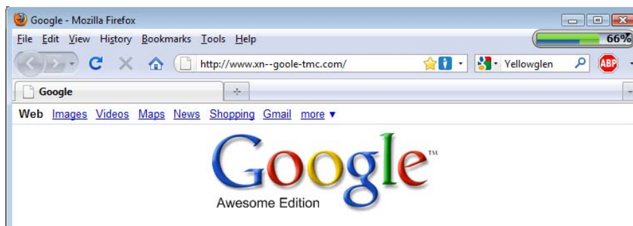
Figure 1: An example of Punycode in the Firefox Browser

A number of countermeasures have been implemented in order to mitigate the effectiveness of this attack. The majority of these involve displaying punycode in place of the actual UTF-8 text. Punycode is an ASCII representation of a Unicode domain name, originally implemented as the domain name service infrastructure did not support Unicode (IETF, 2003). The punycode alternative is commonly displayed in both the address bar and the status bar on hover for a particular link. An example of this may be seen in Figure 1 below.