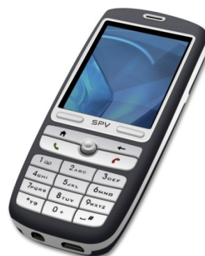
Figure 2 - Evaluation handset: Orange SPV C600