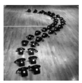
Figure 1. The Disembodied Art Gallery, Temporary Line