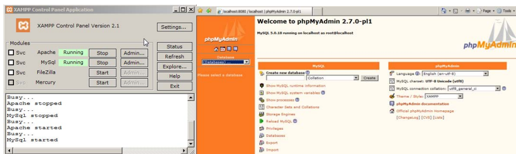
Figure 1: Xampp Server and Web Interface

At the time a number of integrated web and database development environments began to appear, no doubt to address the issue for novice developers struggling to configure their development environments before even getting to work on code. Of the tools available at the time XAMPP from the ApacheFriends organisation ( http://www.apachefriends.de ) was perhaps the most suitable to all facets of the Php unit. It included a single file installer that set up Php (in later versions both Php 4.x and 5.x), the Mysql database, a web based interface onto the database called PhpMyadmin plus an integrated console to individually start and stop these services (see Figure 1).