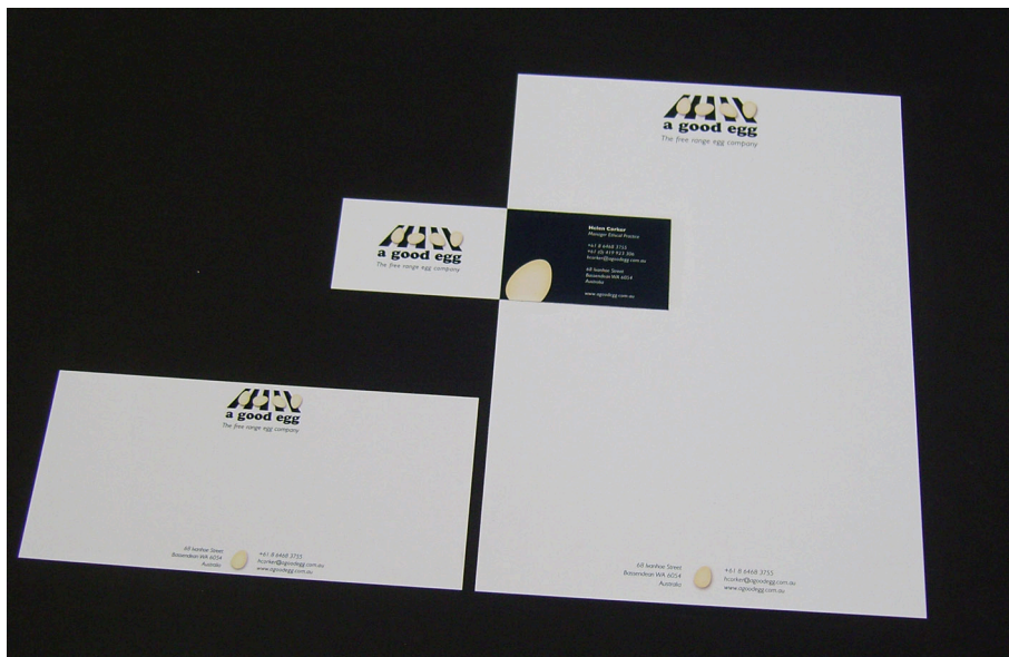
Figure 1 The assignment for Identity Unit that was previously focusing on branding artifacts such as stationaries (work by Helen Croker).