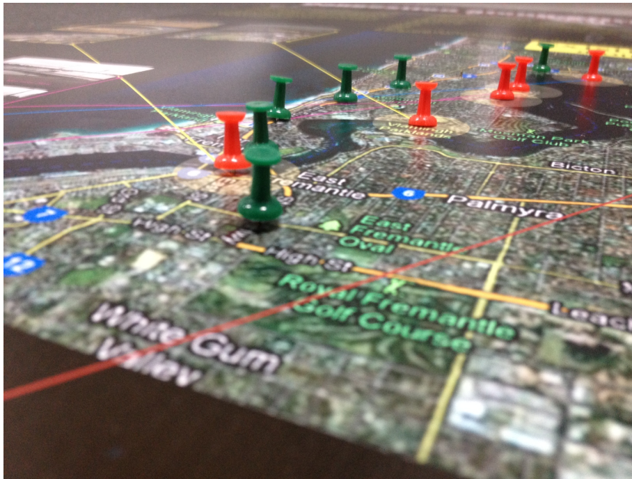
Figure 3 Student, Stephen Ward, proposed a system to activate Perth's river into public transport platforms.

In another project students were given a context and site - Joondalup shopping centre. This context was framed for the students as a 'wicked problem' where sub-problems needed to be addressed. Students then needed to identify manageable problems (eg: wayfinding, theft, accessibility, brand identity, etc) that contribute to the overall issues in the shopping centre. Methods used included