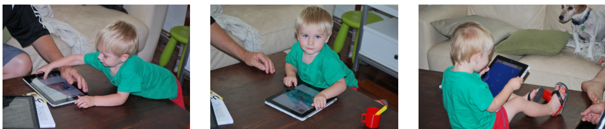
Figure 1: Taking over the iPad.

The first information about any new market tends to focus on its size and its growth, and this market is no different. In the absence of research into the behaviour and activities of pre-schools online, there is some data about adoption rates. There is also ample evidence that the data available is already out of date. Brouwer et al (2011), for example, surveyed 575 parents in the Netherlands. They discovered that not only were touchscreen technologies very popular with children aged 3-6, but parents reported that this age group were quick to master the touch and swipe access techniques. Although only 7% of families owned touchscreens at the time of the survey, 11% were intending to buy one in the coming 12 months indicating a market which would be likely to double in size each year over the next two to three years with a specific focus on families with very young children (Brouwer et al, 2011). A year later, in Norway, researchers reported that 32% of under-3s were already using touchscreens with 23% of 0-6 year olds having regular access to a touchscreen in their home (Guðmundsdóttir & Hardersen, 2102). These figures were slightly higher than in Germany where 17% of families with 3-7 year old children had touchscreen tablets compared with 18% of families where the children were 6-11 years old (Behrens & Rathgeb, 2012).