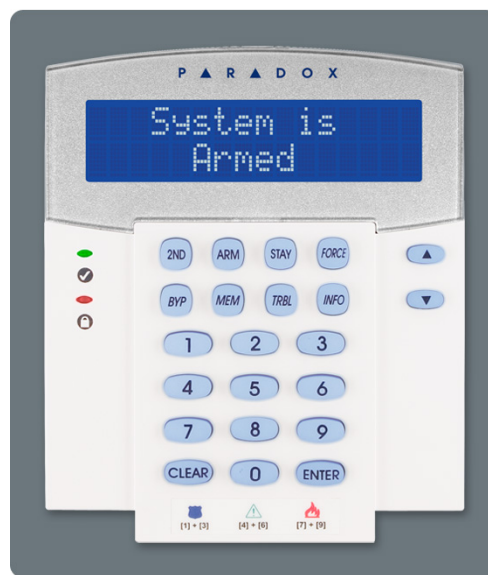
Figure 1. Typical keypad layout

The alarm code analysis indicates that some ranges are far more common than others. Even this small amount of information makes an attacker’s task simpler by indicating which ranges should be attempted first in a brute force attack. If an attacker begins at 0000 then 1000 attempts will result in only a 2% chance of success, yet trying the range of 1000-1999 will result in a 16% chance of success. An attacker can therefore improve their chances of success when trying less than the entire keyspace or on average significantly reduce the time required by trying ranges out of numerical order. By trying 1000-1999 followed by 4000-4999, the attacker will have tried 1/5 of the codes with a 1/3 chance of success. More information about the users’ preferred choices of codes can further speed up the brute force attack. It is common for patterns on the keypad to be used to aid in remembering the code. Figure 1 shows a typical keypad layout. The keys are arranged in a top down manner with 1 at the top left. This is the opposite of a computer keypad where 1 is at the bottom left. The patterns made generally follow straight lines or ‘L’ shapes such as 2580, 1236, 3214 etc. These numbers appear to be random at first glance but plotting their location on a keypad will often show the numbers to be a pattern that is easier to remember than numbers.