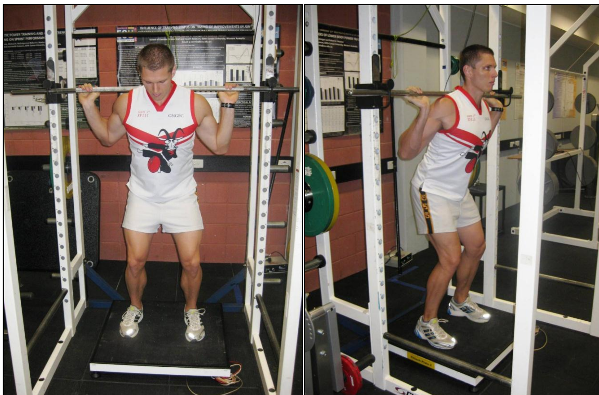
Figure 1 - Set-up and operation of the fixated isometric apparatus.

A uniaxial, portable force plate (dimensions: 795 x 795 mm; maximum load: 1000 kg (9810 N)); standard 20kg Olympic barbell (mass: 20 kg; Australian Barbell Company, Victoria, Australia); and BMS data acquisition software were required for use across both isometric devices. The fixated isometric squat trials were performed using a floor-bolted power rack (Power Cage, Cybex International, MN, USA), with height adjustable bar supports, as presented in Figure 1. The portable isometric squat trials were performed using only a load-bearing, fully customisable heavy duty strap (SureTie, Zenith, NSW, Australia) designed to resist high loads (max: 4218 N (430 kg)), with an anti-retractable locking mechanism to prevent undue movement (loosening or tightening), and hooks to affix the strap to the barbell as presented in Figure 2. The primary difference of equipment between the portable and fixated apparatus involves the exchange of the large-scaled immovable rack, with the more affordable and transportable heavy duty load-bearing strap.