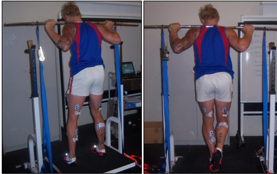
Figure 3 - Adopted subject positioning between bilateral (left) and unilateral (right) testing conditions.

For each bilateral and unilateral condition, two trials needed to produce peak force outputs within 5% of each other to be considered legitimate representations of the subjects maximal force production. If, within the 3 trials provided this was not achieved, a 4 th and 5 th trial per condition was permitted, with two minutes recovery provided per trial. No subject required more than 3 trials during this study, as adequate familiarisation was provided. For analysis purposes, the best trial for each condition across both devices was chosen to compare each athlete's performance between both isometric apparatus, identified by the trial with the greatest peak force (PF) output. In addition, within the portable isometric device, the best two trials for each trial-type were chosen using the same selection criteria in order to assess its reliability in measuring all dependent variables.