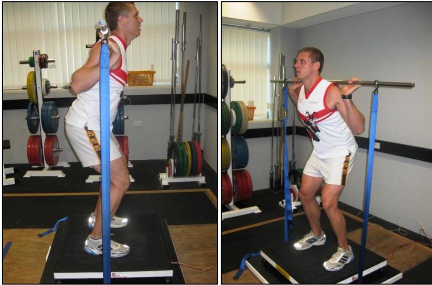
Figure 2 - Set-up and operation of the portable isometric strength apparatus.