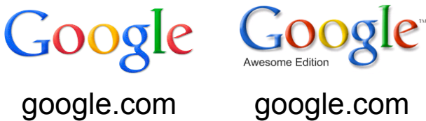
Figure 2 – A pair of Homograph Domains

Traditionally phishing attacks are mitigated through user education, encouraging users to check the legitimacy of links before clicking them, looking for unrelated URLs, not replying to emails asking for information if they are from an external domain name, etc. However when phishing campaigns are modified to make use of homograph domain names the ability for user education to provide mitigate is eliminated, as there is no way to make a visual identification of a fraudulent domain name. Figure 2 shows two domain names, both visually identical, however they lead to separate websites, with the one to the right making use of U+0261 rather than U+0047 for the second G.