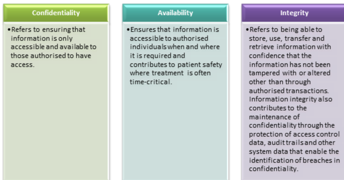
Figure 3: Goals of Health Information

The goals and principles together guide the foundation of NESAF work.