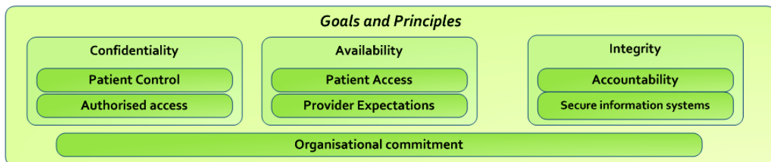
Figure 2: Goals and Principles of the NESAF

The goals and principles of the NESAF are intended to guide the application of the framework in the design and implementation of secure eHealth systems to manage and protect healthcare information (figure 2).