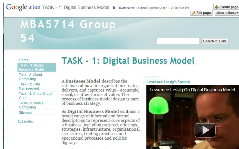
Figure 2: Google Sites Example for a Student Group

Figure 2 shows the Google Sites interface for one of the groups. At the bottom of each page in the wikis, comments and file attachments can be added.