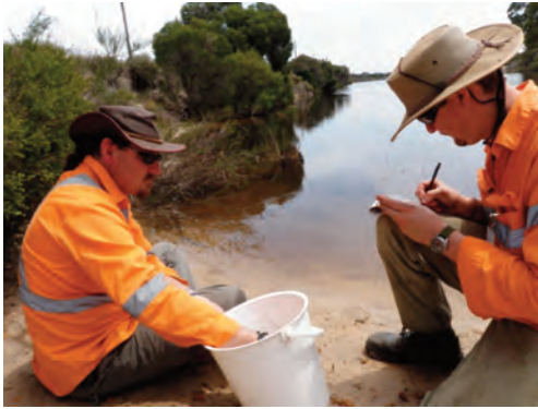
Figure 1 Identifying anaesthetised fish next to Centaur Lake.

fishery in many regional parts of south-western Australia, including the Collie district (Whiting et al. 2000). Increasing human populations have impacted on natural marron stocks and the quality of the recreational fishery (Molony et al. 2001). However, marron have been introduced to Collie pit lakes along with other non-fishery species of crayfish.