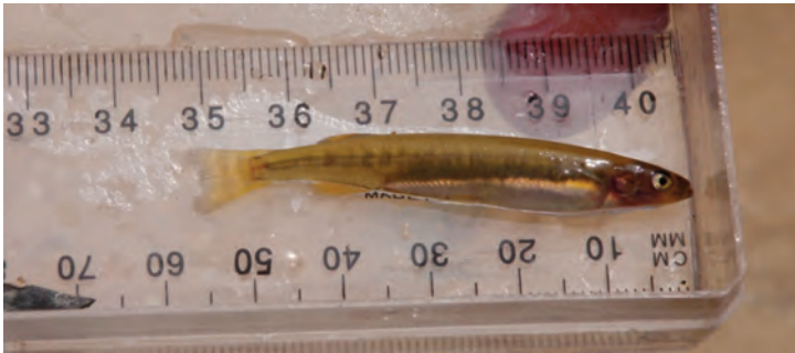
Figure 2 Healthy adult Western minnow ( Galaxiidae : Galaxias occidentalis ) caught in Lake Centaur, November 2009.