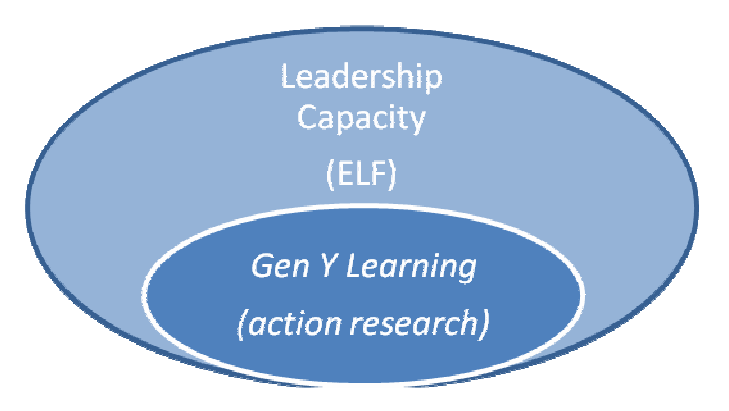
Figure 2: Relationship between two research aspects

The project investigates into how current teaching methods may be improved with respect to how current students, particularly Gen Y and Millennium students learn. The project, to be undertaken over 18 months, is designed as research to inform teaching and subsequently impact leadership capacity in learning and teaching using the ELF framework. Thus, whilst the overarching conceptual framework is the ELF, the research utilises action research as its methodology as shown in Figure 2.