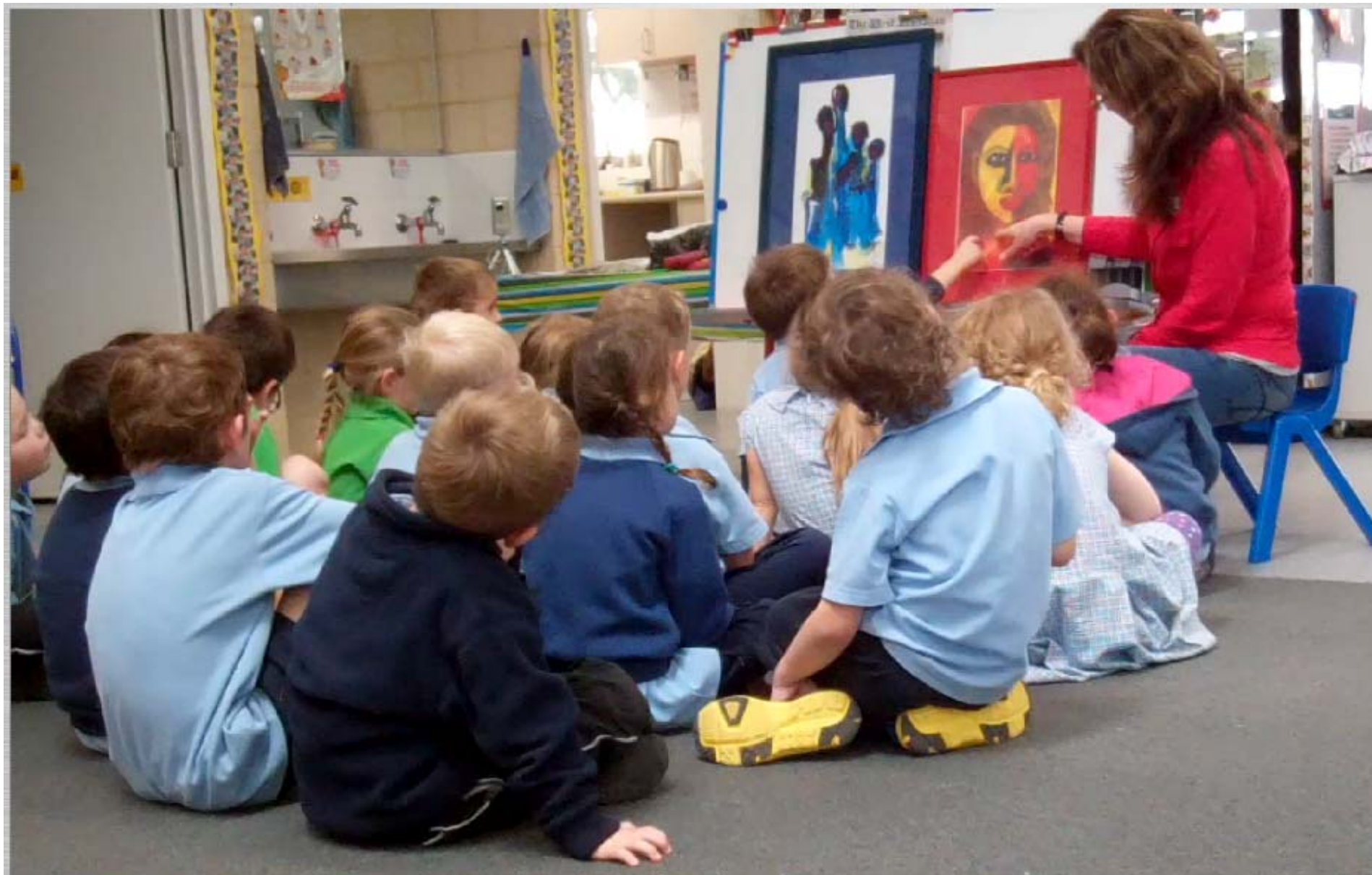
Pre-primary children responding to art (August 2012)