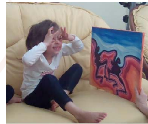
Pre-primary girls responding to an artwork