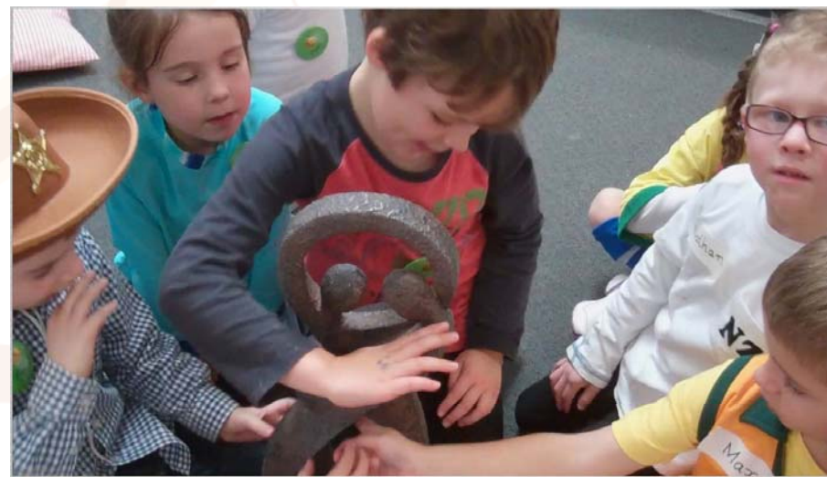
Pre-primary children responding to art