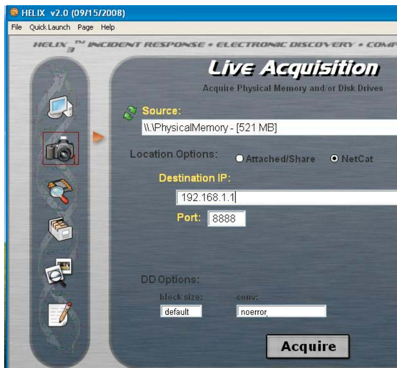
Figure 3: Prepare Suspects VM

The suspect's machine needs to be prepared for live acquisition via the Virtual Infrastructure tool based on the management console machine i.e. VMware vSphere. In order to capture the current state of the VM, Helix CD or Image needs to be emulated via the management console. Upon the launch of Helix.exe or Autoplay, a window opens, such as in Figure 3.