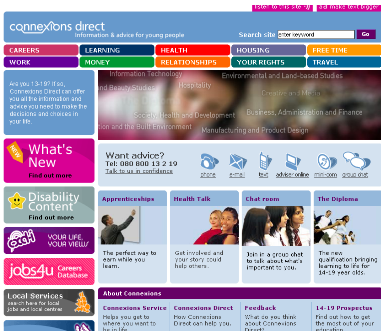
Figure 1: Screen shot of the Connexions Direct home page, showing facilities accessible by young people

A clear strength of this website is the range of opportunities provided for young people to engage with communication aspects, as well as information aspects, of technology. By contrast, a range of LA websites (14-19 Prospectuses) focus much more on information aspects, and much less on communication aspects (see Passey, Williams and Rogers, 2008).