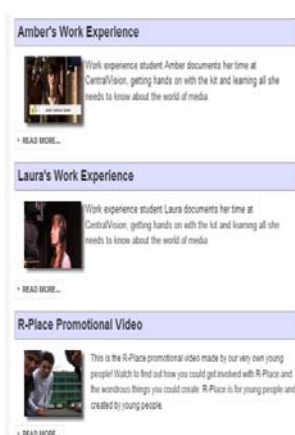
Figure 5: Screen shot of the R-Place Channel page giving access to young people's videos

Films can be about any topic. For example, 'Supermarket Smoke' – a fresh examination of the drugs issue, 'Ghost Story' – a fictional tale of love and betrayal, and 'Bottle Battles' – a spoof sports event. The films are about topics or themes the young people are interested in rather than films about themselves. Some personal profiles have been done on film (see Figure 5), with those young people who are comfortable working with the film team in that way. It is felt that more personal profiles should be done.