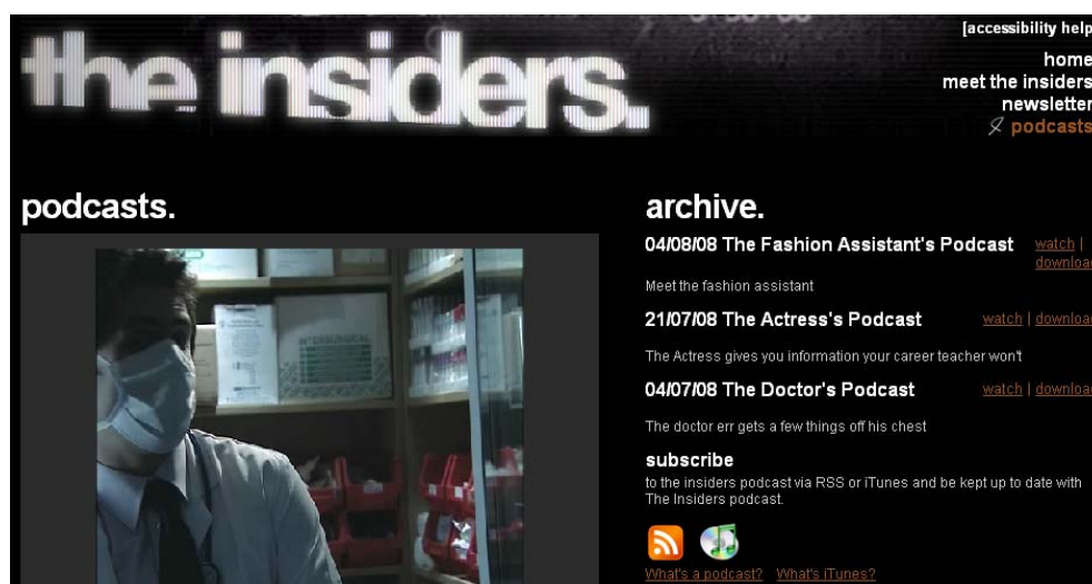
Figure 2: Screen shot of the web page showing the doctor’s podcast being played

A key issue with websites that provide details about opportunities is that they rarely provide young people with any insight about what certain jobs or opportunities involve, what they might be doing when they apply for a job or join a course, or what others have felt about their experiences. A new education development from Channel 4 (2008), called ‘The insiders’, offers some examples of insider insights from young people who have been involved in certain jobs or opportunities. This career information project uses short comedy clips developed from real-life work blogs of individuals working in a number of professions (including a policeman, a teacher and a fashion assistant). A screen shot of the doctor’s pod cast being run is shown in Figure 2.