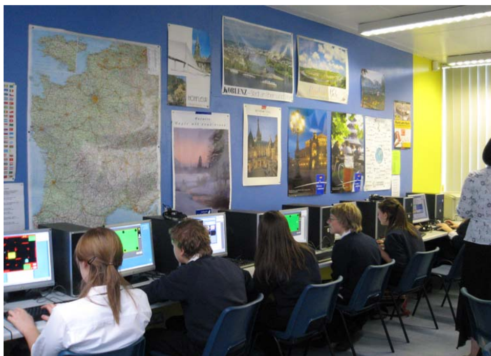
A language lesson – independent learning in class

“Well, they’ll often say, ‘Oh, I tried and then it failed’, and then you go into activity reports and you look at the logs and you say, ‘Oh look, that’s interesting, you didn’t access it actually, because look...’. So on this log I can see that that particular student has accessed from outside the school on these occasions, right, and I can see what they’ve done. Look, he’s done the Cybersmart quiz, which is an e-safety thing; he’s accessed the Avatar application...” (IT Head)