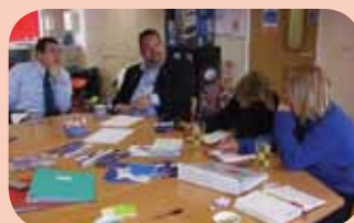
Learners from Moray having their say

Members of Moray Adult Learners' Forum were invited to attend the Western Isles Learners' Conference, Community Voices , which took place in South Uist as part of 2008 International Literacy Day celebrations.