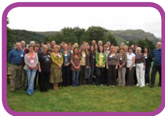
The first cohort of TQAL students, staff and practice tutors, Stirling, September 2008

The Teaching Qualification: Adult Literacies (TQAL) entered a new phase of development in 2008 with 52 adult literacies tutors from across Scotland accessing either the Diploma in Higher Education (Adult Literacies) at Forth Valley College or the Professional Graduate Diploma in Education (Adult Literacies) at Dundee, Aberdeen or Strathclyde Universities. This second pilot of the qualification is fully funded by Learning Connections and has taken on board recommendations from the evaluation of the first pilot. An end of course conference in Stirling in September 2008 celebrated the achievements of the first cohort of TQAL students and Practice Tutors. Individuals who undertake a support and mentoring role in the workplace to those on TQAL can also access a Masters level qualification, the Practice Tutor Award , at Aberdeen University. This suite of qualifications has contributed significantly to the professionalisation of the adult literacies workforce in Scotland.