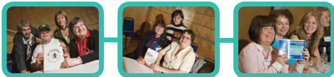
Learners from Deafblind Scotland, Scottish Borders and North Ayrshire read their work on International Literacy Day 2008

At the International Literacy Day Conference in 2008, the Scottish Book Trust and Learning Connections launched a new partnership initiative. The aim of the partnership was to support the development of a range of publications by adult literacies learners for adult literacies learners across Scotland. Many groups will have their writing published whilst others will receive practical support in relation to using publishing software or dealing with printing companies. The publications will be launched at Learning Connections' International Literacy Day Conference 2009. They will then be distributed to literacies learning providers across Scotland.